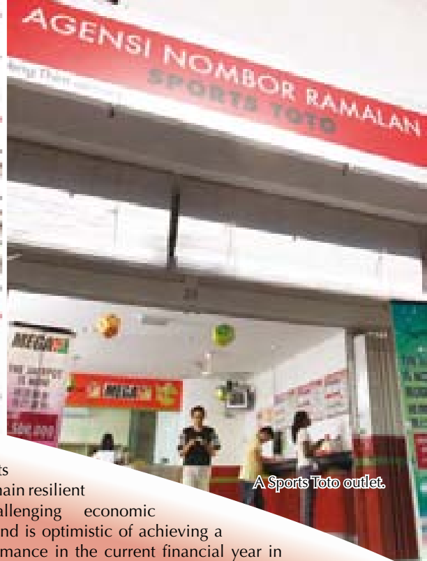
A Sports Toto outlet.

Being part of Berjaya Group, we worked hand in hand with Berjaya Cares Foundation (“BCF”) to synergize our efforts in order to create better and more effective results. During the year under review, we participated in the BCF community outreach programme where we visited old folks’ homes in Selangor, Kuala Lumpur and Perak along with other Group volunteers. We also donated items of necessities to old folks’ homes in Selangor and Kuala Lumpur under the ongoing BCF collection of charity contributions for needy charity homes and NGOs.