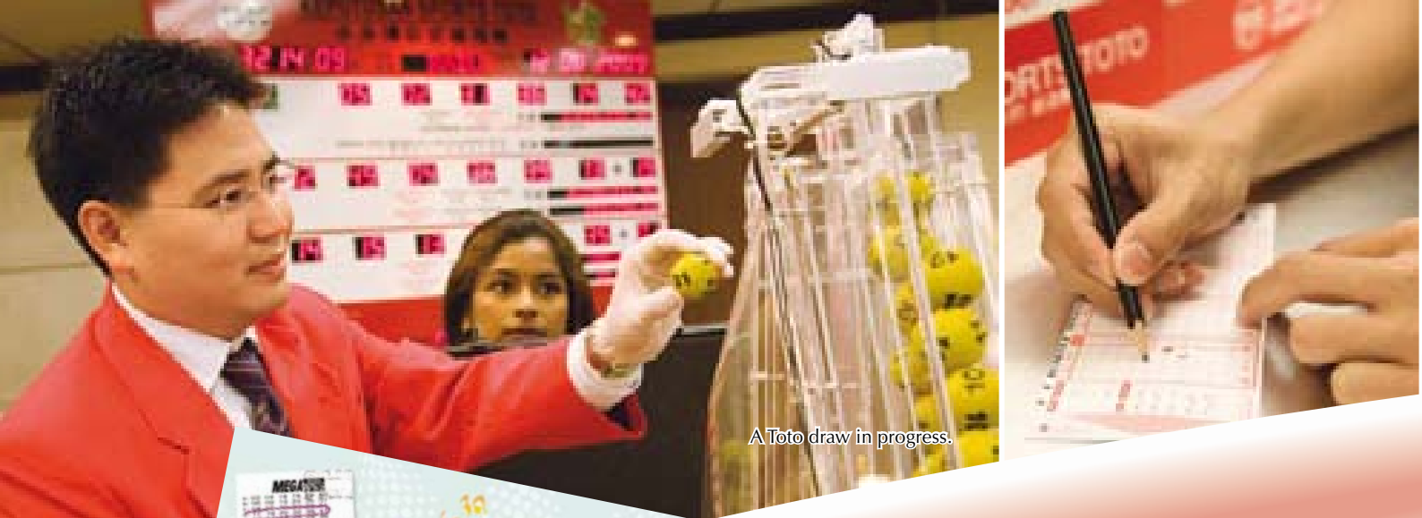
A Toto draw in progress.