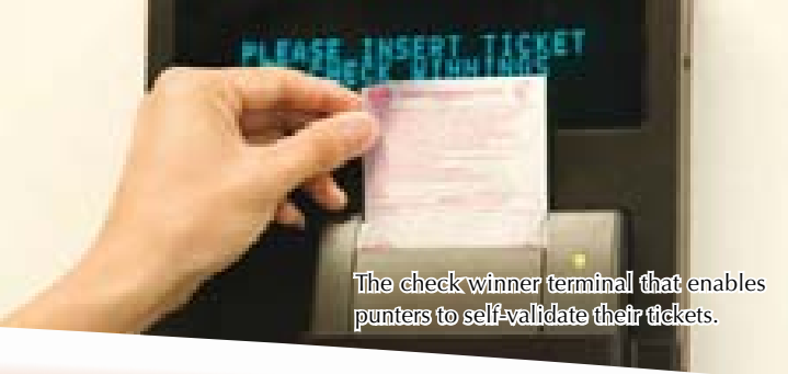
The check winner terminal that enables punters to self-validate their tickets.