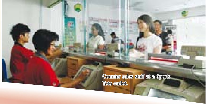
Counter sales staff at a Sports Toto outlet.

In May 2008, ILTS entered into a contract with Two Jo Company Ltd. of Ulaan Baatar, Mongolia for the delivery of a turnkey system, complete with central system hardware and software and new sales terminals. The new system was delivered within five months and its lottery operations commenced in September 2008.