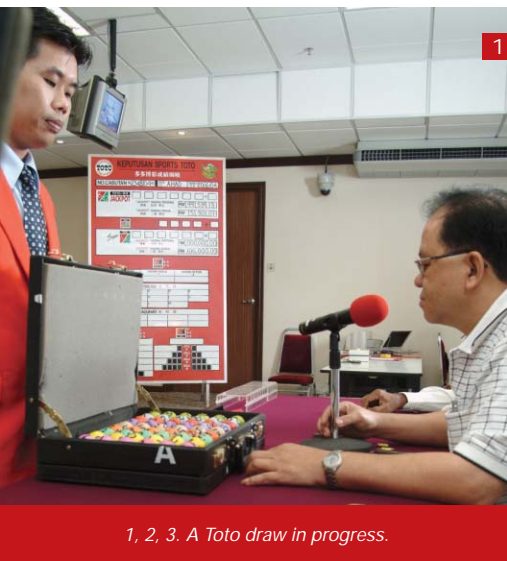
1, 2, 3. A Toto draw in progress.