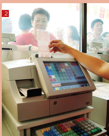
1. A Sports Toto outlet.