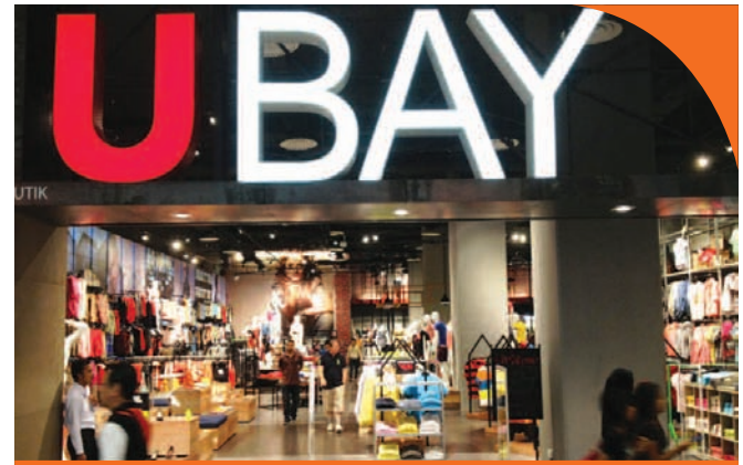
UBay 是一个为年轻赶上潮流者而创造的品牌,并满足他 们对优质服装的需求。