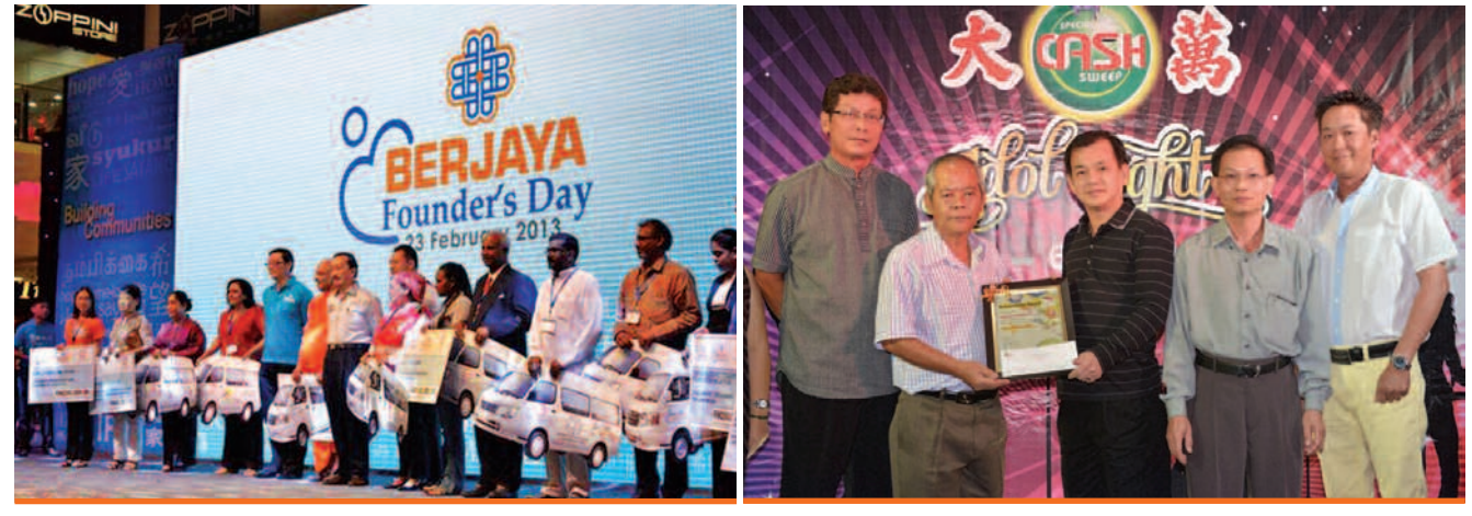
BTS was the venue sponsor for Berjaya Founder's Day 2013.

In addition, NASB also sponsored the Padawan Raft Safari during its Padawan Festival celebration which had 400 local and foreign participants.