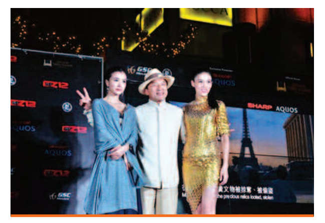
成龙登台亮相的 CZ12 电影推介礼。

康宁药剂(Caring Pharmacy),一家售卖各种护肤品和个人护理产品,并拥有全职药剂师的概念店。