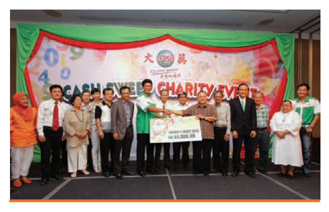
在 NASB 的 2013 年 CASHSWEEP 慈善活动上捐助各福利 和慈善组织。

NASB 也配合农历新年而举办年度的 CASHSWEEP 慈善活动, 砂拉越州各地有大约 800 名来自 20 个慈善组织的居民 获赠捐款和红包。