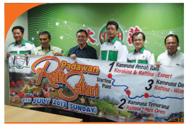
NASB donated RM10,000 to Padawan Raft Safari, organised during the Padawan Festival by the Padawan Municipal Council.