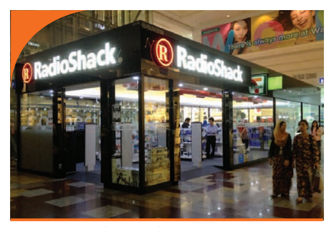
Radioshack 呈献最新的流动装置,科技,工具和 DIY 产品。

NASB 的企业社会责任计划包括每年捐献 RM30万给 Sarawak Turf & Equestrian Club 的肾脏基金,以协助因患 上肾衰竭病而需要帮助的弱势人士,让他们在古晋,诗巫 和美里多家洗肾中心接受洗肾治疗。