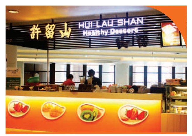
Hui Lau Shan, Hong Kong based healthy dessert store whose initials mean 'Health, Leisure and Style'.

In a strategic move, BTSSB acquired the prominent The Zon Johor Bahru on 15 March 2013. Currently, a rebranding exercise is underway to launching the property's new name, Berjaya Waterfront. Spreading over 18 acres of prime land, the property boasts a direct seafront and is a full-fledged integrated leisure development catering to the middle to mass markets and tourists.