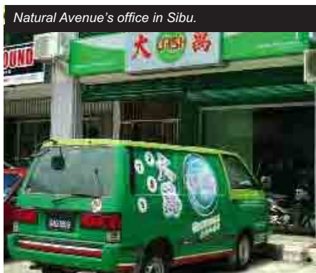
Natural Avenue's office in Sibuan.