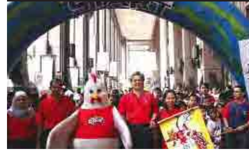
The Roasters Chicken Charity Run 2009 kicked off at The Boulevard, Berjaya Times Square.