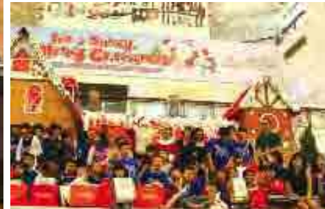
Children from Home of Joy celebrating Christmas with Santa Claus at Borders Bookstore located at Lower Ground Floor, Berjaya Times Square.