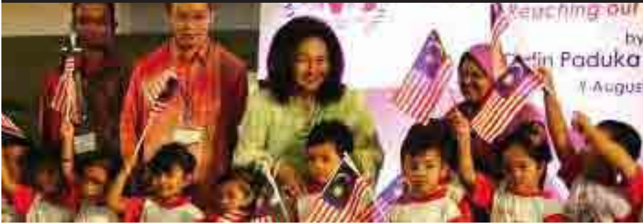
YA Bg Datin Paduka Seri Rosmah Mansor, wife of the Prime Minister of Malaysia, graced the Thalassaemia Awareness Campaign in Berjaya Times Square.