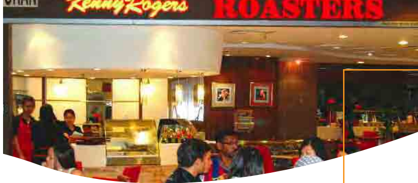
Kenny Rogers is a must for those who love nourishing wholesome meals.