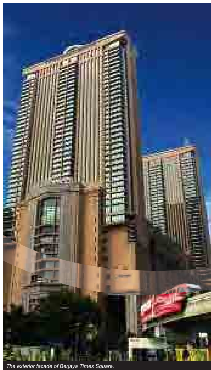
The exterior facade of Berjaya Times Square.