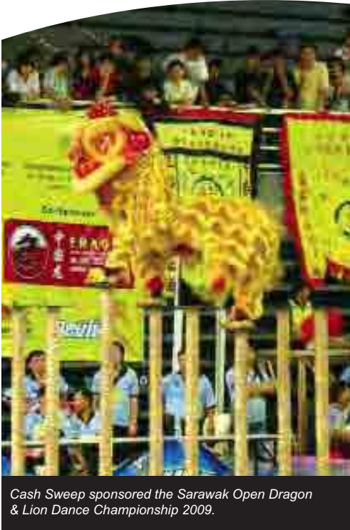
Cash Sweep sponsored the Sarawak Open Dragon & Lion Dance Championship 2009.