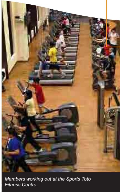
Members working out at the Sports Toto Fitness Centre.