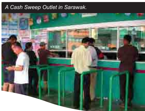
A Cash Sweep Outlet in Sarawak.