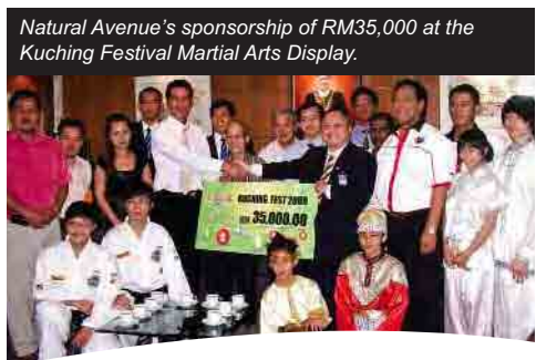
Natural Avenue's sponsorship of RM35,000 at the Kuching Festival Martial Arts Display.