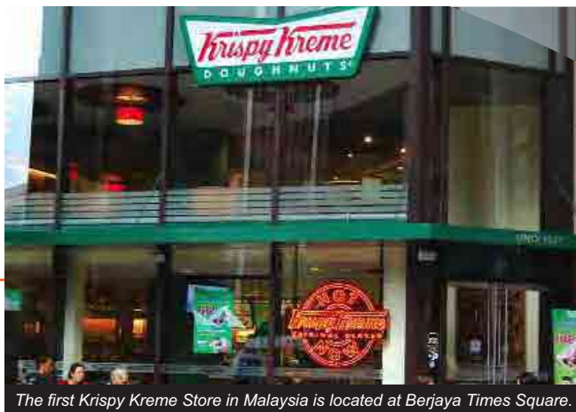
The first Krispy Kreme Store in Malaysia is located at Berjaya Times Square.

For the financial period ended 30 June 2010, the Company proposed a final dividend of 2% per share less 25% income tax for the approval of shareholders at the forthcoming annual general meeting (30 April 2009: RMNil).