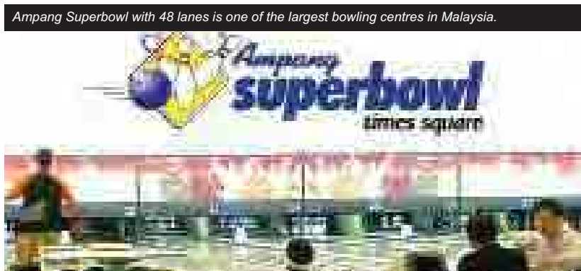
Ampang Superbowl with 48 lanes is one of the largest bowling centres in Malaysia.