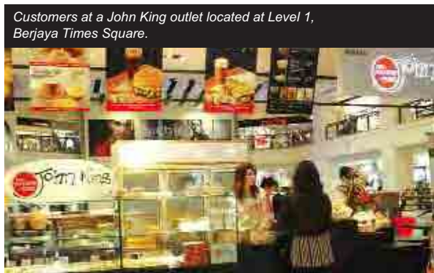
Customers at a John King outlet located at Level 1, Berjaya Times Square.