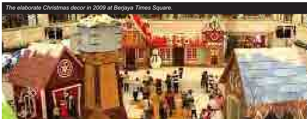
The elaborate Christmas decor in 2009 at Berjaya Times Square.