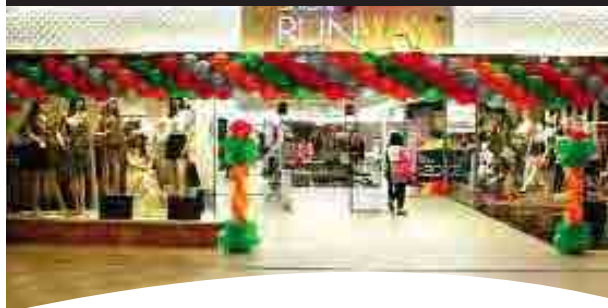
Fashion Runway located at Level 4, Berjaya Times Square for the budget conscious shoppers.