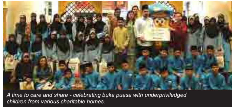
A time to care and share - celebrating buka puasa with underprivileged children from various charitable homes.

Barring any unforeseen circumstances, the Directors envisage that the operating performance of the Group for the forthcoming financial year ending 30 June 2011 will be satisfactory.