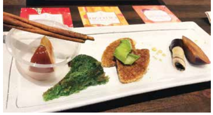
Coffee Masters prepared their own food pairing and presentation

A total of 45 new and regular participants attended the 3 sessions. The participants were really delighted with the presentation as well as the coffee knowledge which they gained over the coffee chat session. Starbucks expects to have more participants join them in their upcoming Coffee Chat session.