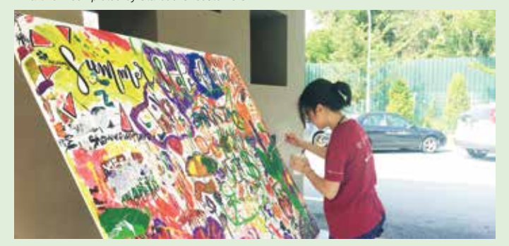
A Starbucks customer putting on some final touches to her artwork.