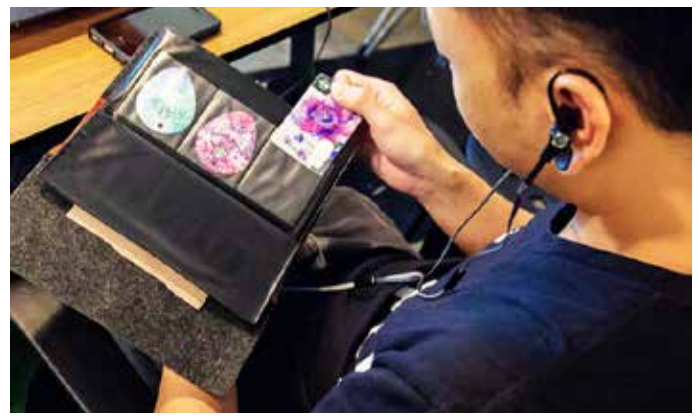
The Starbucks Card Album fits up to 30 pieces of cards.

Starbucks launched the Starbucks Card Album for their customers who are fans of their Starbucks cards. The album is redeemable at selected Starbucks stores and comes in a colour combination of grey and brown made out of wool and leather. The card album is lightweight and can fit up to 30 pieces of Starbucks cards.