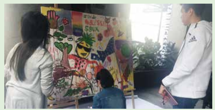
An artwork completed by Starbucks' customers.