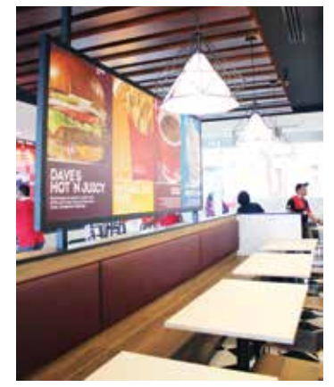
The new store design showcases Wendy's signature products.