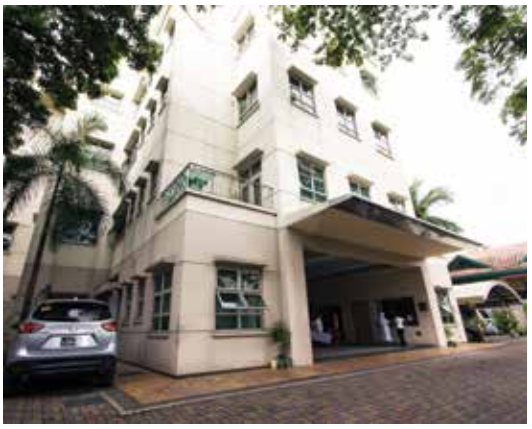
The San Lorenzo Ruiz Home for the Elderlv.