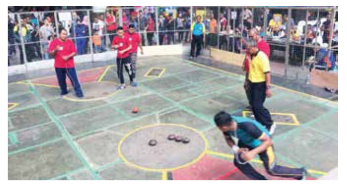
MALAYSIA GASING CHAMPIONSHIP 2017

From 27 July to 30 July 2017, a social awareness activity was held to encourage the public to think about the best of their own selves in everyday settings. The activity culminated with an exhibition showcasing submissions of favourite public stories alongside works of guest artists. There were also paintings, installation art and poetry to discover The Best of You.