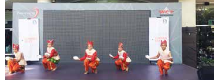
Dancers doing a dance routine with plates.

In each session, the eye-catching performances and beautiful voices of the talents attracted plenty of attention and people gathered around the area to cheer for them. Some of the customers even came earlier to the store just to "reserve" the perfect seats for the 2-hour performance.