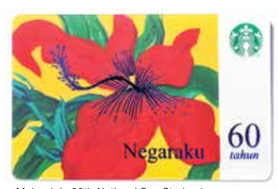
Malaysia's 60th National Day Starbucks Card.

This card is definitely a collector's item for Starbucks Card collectors.