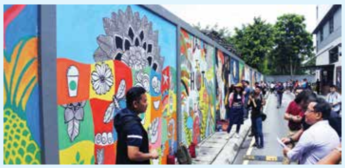
The artists introducing their wall to the members of the media and public during the unveiling ceremony at Starbucks Ampang DT.

After the launch, these selected Starbucks stores of the project became popular attraction spots for both tourists and locals. Starbucks is delighted to have become a platform for young talents to showcase their creativity to a broader audience.