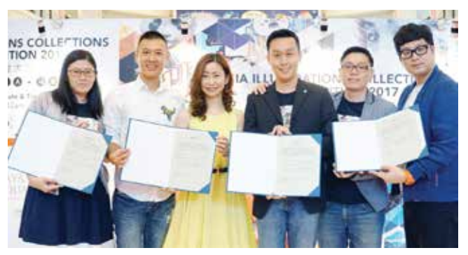
ASIA ILLUSTRATIONS COLLECTIONS ART EXHIBITION 2017