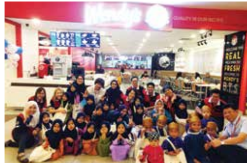
Wendy's team members and the children and caretakers of Rumah Amal Asyura. 27 / BeritaJaya Issue 3, 2017