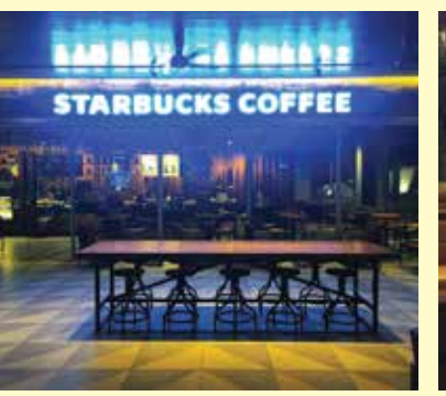
The spacious indoor and outdoor areas of Starbucks GHPO.

The Starbucks GHPO's coffee experience bar allows its baristas to interact with customers.