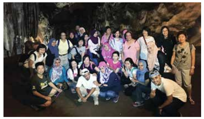
The team at Gua Tempurung

After an enjoyable lunch at Gua Tempurung, they headed to Gaharu Tea Plantation where everyone learned about the benefits of the Gaharu tree. They had a short tour around the plantation for photos before ending the trip with a lucky draw session. Group HR & Admin would like to thank all their sponsors for their generosity and awesome gifts.