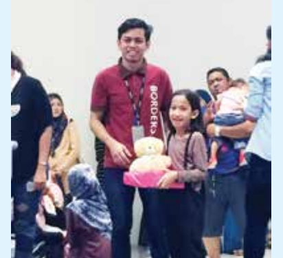
One of the winners receiving her prize.

On the day of the event, participants for each category also received soft toys sponsored by Hallmark. This fun event brought smiles to the children and strengthened the bond between parents and their children.