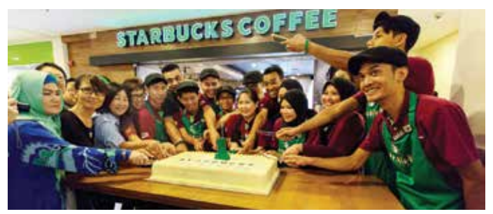
Starbucks Signing Store partners and guests cutting the cake.