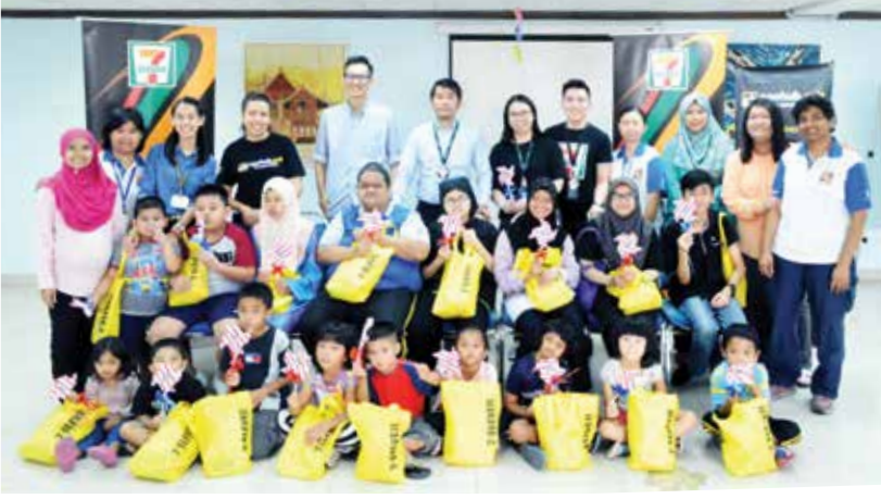
Participants from Malaysia Federation of the Deaf with their artwork and the team from 7-Eleven Malaysia.

As communication is important for the community, 7-Eleven Malaysia organised the activity to help build the participants' confidence and ability to interact with others. Concurrently, it would enhance their creative skills and encourage them to develop further interest in creative-based projects. A simple Q&A about Malaysia was also conducted to educate and expand their knowledge about the importance of patriotism and unity.