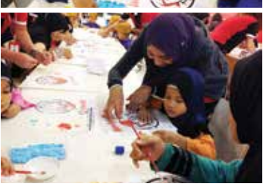
Wendy's staff assisting the children during the arts and crafts activity.