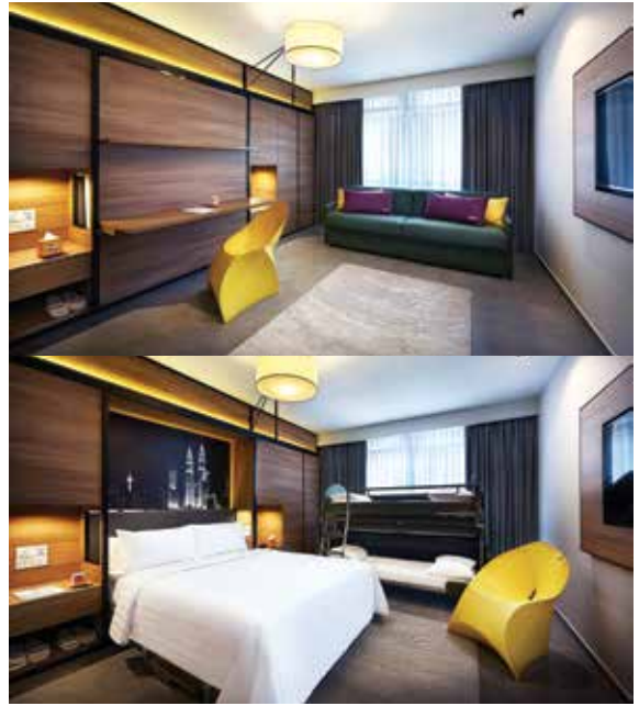
The interior view of 'thelivingroom' hotel's room. (Top: Before, Bottom: After)

A designer piece that reflects stylish statement and modern aesthetic. When not in use, it can be folded to be stored anywhere in the hotel or room.