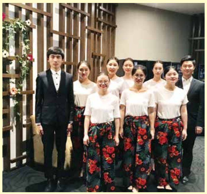
Students dressed up for the occasion.

On 12 August 2017, BERJAYA UCH hosted a wonderful afternoon tea at Samplings on the Fourteenth. Delectable pastries, sandwiches, scones and other savoury items were perfectly paired with a selection of teas from Tea Drop. As part of the students' practical exam, culinary, hospitality and exchange students from Sichuan worked together with lecturers to ensure guests experienced the Berjaya hospitality.