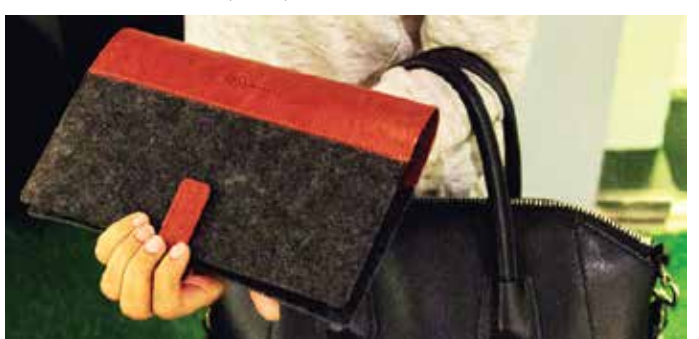
The Starbucks Card Album is made of wool and leather.