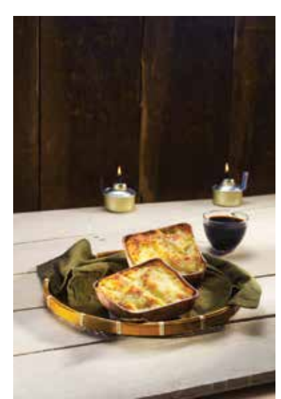
The Mini Wrap Chicken Pasta Rendang with Cheese.