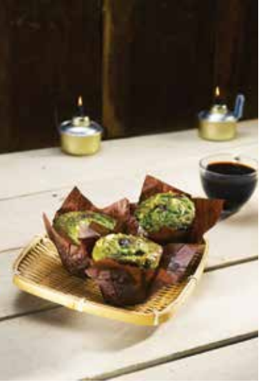
The Ondeh-Ondeh Muffin.

A screen capture of the video on Youtube.