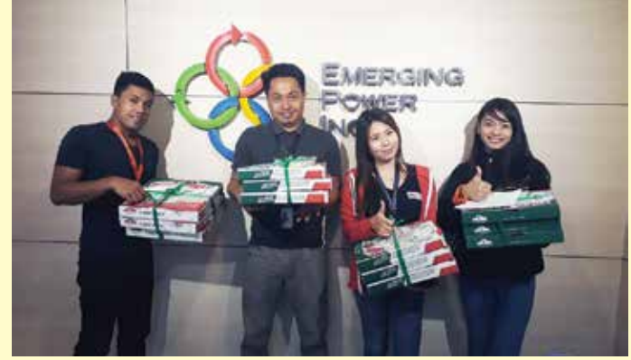
Advance order made by the Philippine Stock Exchange Center (PSEC) Tektite.