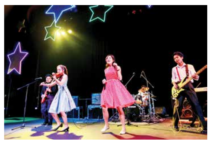
Band champion - AfterGlow (SMK Sri KDU)