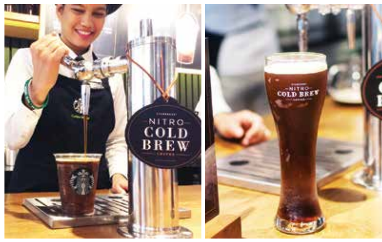
A Starbucks barista pouring the new Starbucks Nitro Cold Brew.

The Starbucks Nitro Cold Brew is currently only available at selected Starbucks stores in Malaysia such as Starbucks Reserve Publika, Starbucks Reserve Sunway Pyramid and Starbucks Warisan Square. To encourage customers to try out the new Nitro Cold Brew, customers who purchase Starbucks Nitro Cold Brew Glassware get to enjoy a complimentary Grande Nitro Cold Brew on the spot.