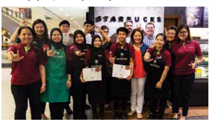
Starbucks Malaysia partners and the Starbucks International team.