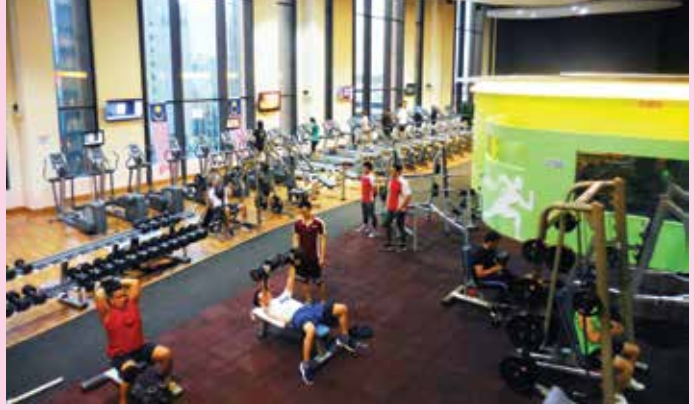
An overview of the Sports Toto Fitness Centre from the Mezzanine floor.

Find out more at http://www.sportstotofitness.com