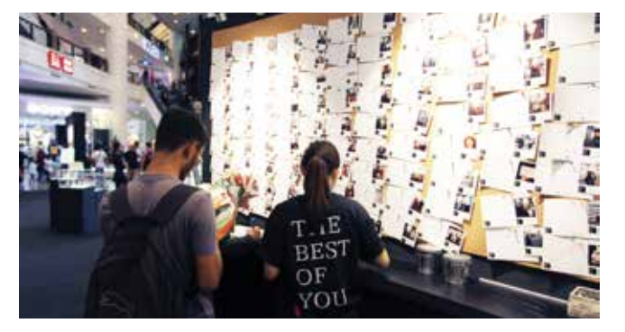
THE BEST OF YOU EXHIBITION

From 27 July to 30 July 2017, a social awareness activity was held to encourage the public to think about the best of their own selves in everyday settings. The activity culminated with an exhibition showcasing submissions of favourite public stories alongside works of guest artists. There were also paintings, installation art and poetry to discover The Best of You.