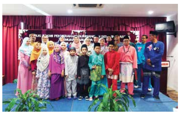
7-Eleven Malaysia and several beneficiaries of Semurni Kasih gathered together for the handover and celebration.

On 28 July 2017, 7-Eleven Malaysia engaged with customers to support the underprivileged community through their annual CSR initiative, Semurni Kasih. RM3,025,937.83 worth of provisions consisting of food and non-food products were gathered at the end of the campaign, and these provisions such as canned food, biscuits, rice, bottled and canned beverages, as well as medicine were distributed to more than 190 charity homes and charitable causes across the country.