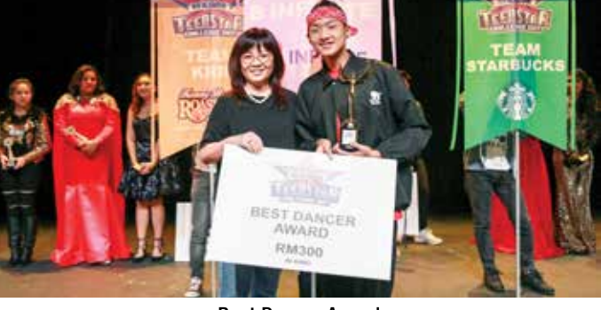
Best Dancer Award

Digital Strategy of Starbucks Malaysia and Brunei