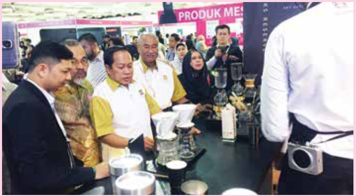
Ministry of International Trade and Industry Deputy Minister Datuk Ahmad Maslan at the Starbucks Reserve booth at HalFest Asean 2017.

Starbucks received overwhelming favorable response not only from the attendees, but also the VIPs of the event, the ministries and local celebrities such as Chef Wan, a Singapore-born Malaysian celebrity chef.