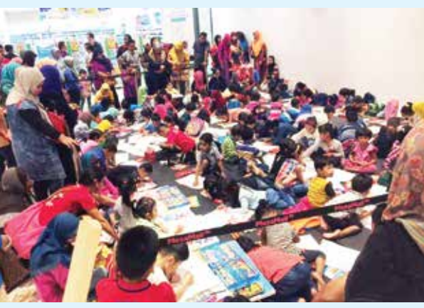
Children concentrating on their artwork for BORDERS Merdeka colouring contest.