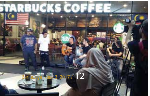
Filming of the 'HURU HARA' talk show at Starbucks IOI City Mall Putrajaya.

This collaboration impacted positively on the store with increased sales transactions and awareness.