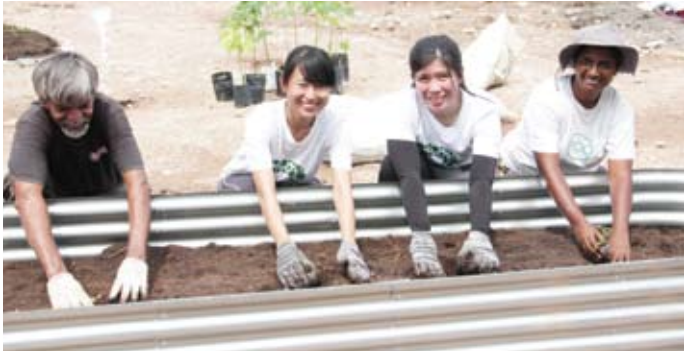
Laying the seedlings.