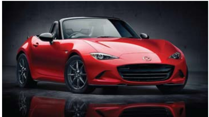
The all-new Mazda MX-5.