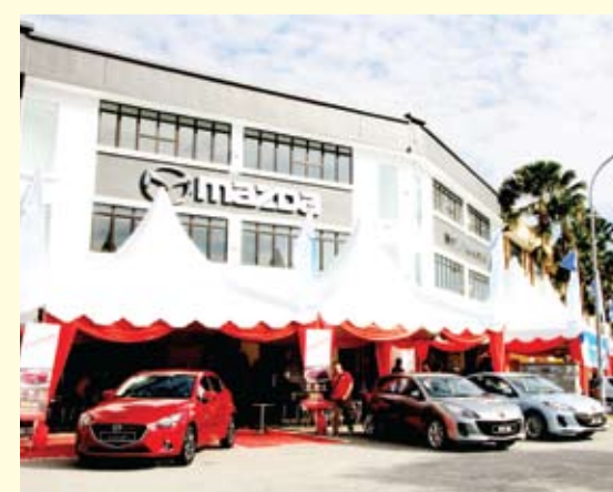
The Mazda Anshin Pre-Owned Centre in Glenmarie.

Bermaz has been consistently displaying its unfaltering commitment to deliver the best ownership experience for the customers, especially with its extensive Free Warranty and Maintenance Programme, and this extends to the pre-owned cars as well.