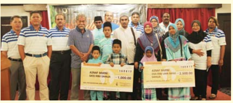
The management of Staffield Country Resort together with the representatives of Asnaf Murni Charity Home.

In conjunction with this special occasion, Staffield Country Resort donated RM3,500 to the Asnaf Murni Charity Home as an act of support towards the organisation. Asnaf Murni Charity Home is a shelter for orphans in Seremban and has been operating since 2011. The children of the Asnaf Murni Charity home were also invited for the Aidilfitri Invitational Golf Prize Giving Dinner.