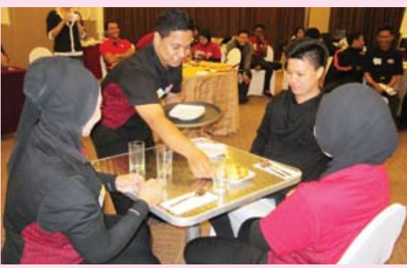
Participants illustrating the essentials of excellent guest services from greeting to table serving