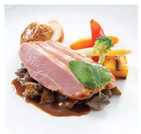
Roasted Smoked Duck Breast.