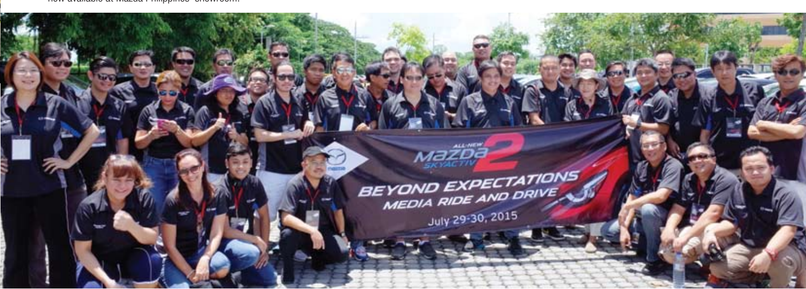
Group photo of the motoring journalists and the team from Berjaya Auto Philippines.

To help the journalists document their driving experience, CameraHaus, distributors of a wide variety of photography and video equipment provided documentation gear for their use as well as prizes for a photography contest undertaken during the event.