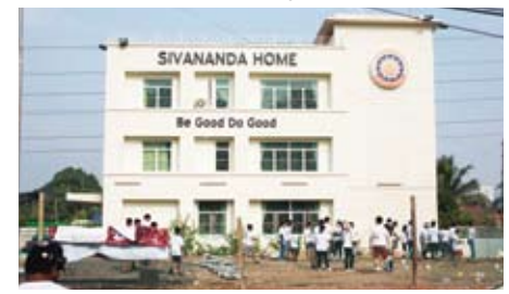
The edible garden site on an empty plot of land measuring about 4,000 sq ft.