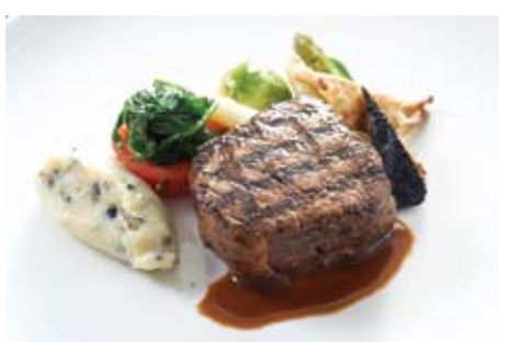
The Australian Waqvu Beef Cheek.