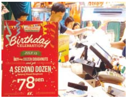
Krispy Kreme fans purchasing a great deal offer