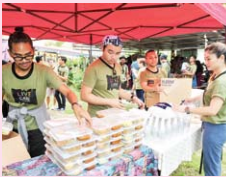
Some of the staff preparing lunch