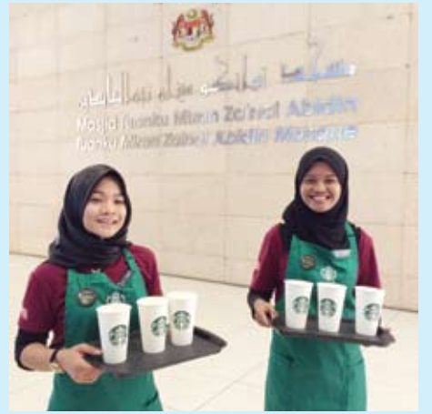
Starbucks Baristas served drinks to participants.

Starbucks sponsored prizes for the lucky draw session as well as coffee for participants that morning. The goal of this event was to increase public awareness on the importance of Malaysia's halal certification. This awareness can improve public confidence in the Malaysian Halal logo and the logos of halal certification bodies recognized abroad. This event was significant to reinforce Starbucks as a halal brand in Malaysia.