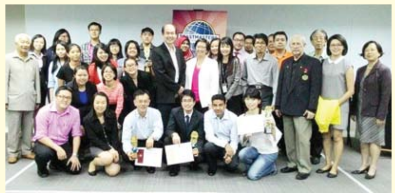
2015 Berjaya UCH Toastmasters Club Humorous Speech and Evaluation contest.