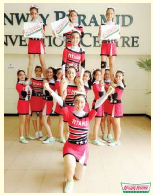
Cheerleaders proudly present the joy of Krispy Kreme as an ambassador for CHEER.