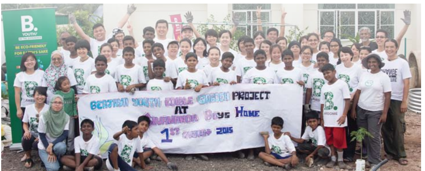
Berjaya Youth volunteers and children of Sivananda Home celebrating the completion of the edible garden build project.