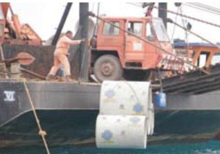
The process of lowering the concrete pipes into the sea.