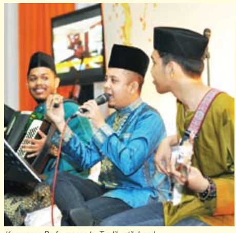
Keroncong Performance by Tradikustik band.