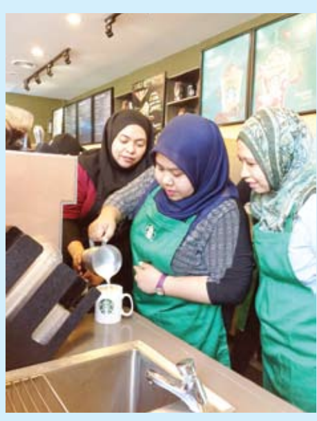
Starbucks coffee masters guiding their protégé for the day.

Have you ever wondered how an expert barista can craft a perfect latte? On 6 July 2015, three media friends had the opportunity to experience Latte Art Training at Starbucks Drive-Thru, Kota Kemuning, Shah Alam. Four of our talented coffee masters were there to provide guidance and support for this short and fun session. Our coffee masters demonstrated how to pour a 'heart' and a 'rosetta'. All three students were impressed with our coffee masters' latte art techniques.