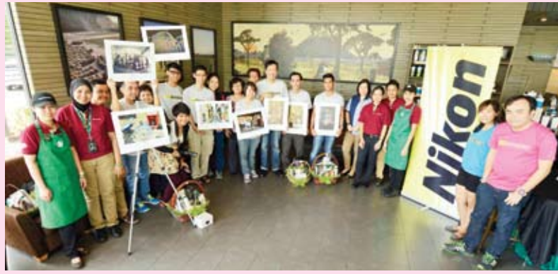
Participants proudly presenting their creative artworks