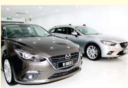
A wide array of Mazda cars is available at the Mazda Anshin Pre-Owned Car Centre