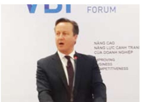
David Cameron, Prime Minister of the United Kingdom, shared his views at the Vietnam Business Forum.