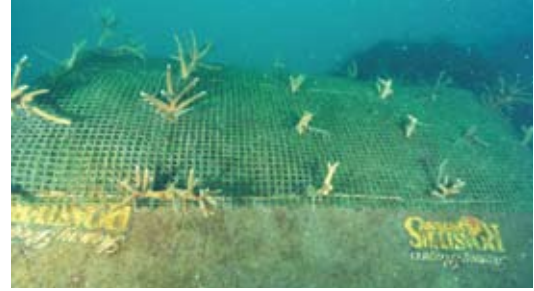
Planting of corals to propagate coral reef growth.

Published by Berjaya Corporation Berhad (554790-X), Corporate Communications, Level 12, West Wing, Berjaya Times Square, 1 Jalan Imbi, 55100 Kuala Lumpur. Printed by Sprintserve Enterprise, No AS84, Jalan Hang Tuah 4, Salak South Garden, 57100 Kuala Lumpur.