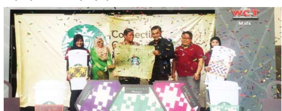
Successfully launched - Starbucks Hot Sleeve Cup and merchandise products made from Mengkuang.

Starbucks is committed to empowering local Malaysian communities and aims to build a better tomorrow for communities across the nation. Among the products featured were the Starbucks Mengkuang Hot Cup Sleeve, Mengkuang Coasters and Mengkuang Bags.