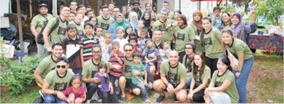
Group photo of the BHR team with the children.