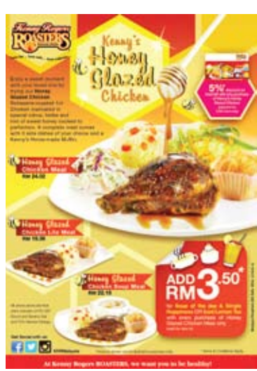
Three meal options for Honey Glazed Chicken.