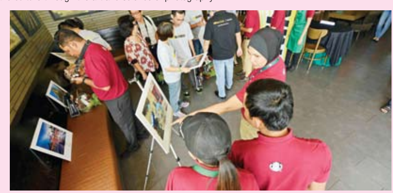
Starbucks and Nikon staff amazed by the photography skills of the contestants.

Through this competition, participants from different walks of life were able to put their skills to the test to immortalise the splendour of lpoh state, while allowing them to explore their creativity in presenting their love of nature and culture through the art and science of photography.