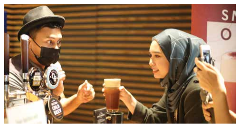
The Starbucks Reserve™ tour livestream in progress.

At the conclusion of the livestream, viewers were also treated to a lucky draw, where 5 lucky winners walked away with an exclusive Reserve<sup>™</sup> 5th Anniversary Malaysia Starbucks Card and other prizes. The livestream had a consistent viewership of about 500 throughout the session, with total views reaching 70,000 on IGTV.