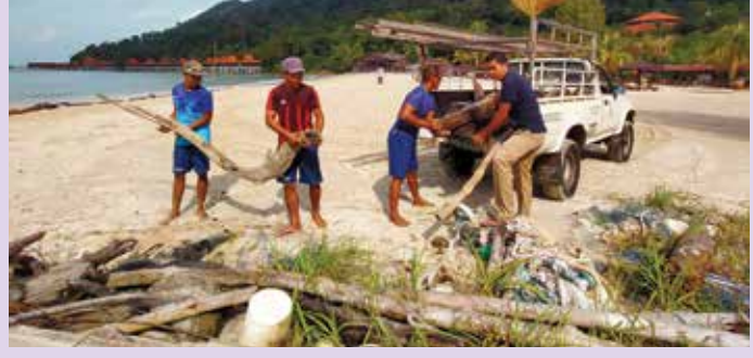
Participants working together for the beach cleanup at Berjaya Langkawi Resort.

In conjunction with World Clean-up Day 2020 on 19 September 2020, staff members of The Taaras Beach & Spa Resort and Berjaya Langkawi Resort came together to show their support by participating in a beach cleanup activity held at the respective islands to raise awareness on the mismanagement of waste. A total of 18 resort staff members, 30 students, 2 teachers from S.K. Pulau Redang and 2 interns from Sea Turtle Research Unit (SEATRU) from The Taaras Beach & Spa Resort, and 30 staff members from Berjaya Langkawi Resort participated in this event.