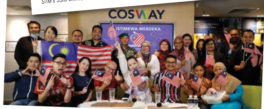
Cosway opened its doors to guests from Rumah Kasih Harmoni from Paya Jaras, Selangor to commemorate Cosway's Facebook Live Merdeka celebration at Menara Cosway. They contributed daily essentials which included washing machines, toiletries, and face masks.