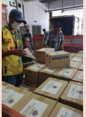
Berjaya Corporation Berhad's donation of 1 million latex gloves to Red Cross Society of China to help curb the spread of COVID-19.