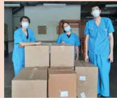
In the Philippines, BPI donated PPE amounting to approximately Peso1 million to various hospitals, namely The Medical City and St. Camilus Medical Center in Pasig City, St. Dominic Hospital in Bacoor Cavite, St. Martin de Porres Charity Hospital in San Juan City, East Avenue Medical Center in Quezon City, and Lucena United Doctors hospital in Quezon Province.