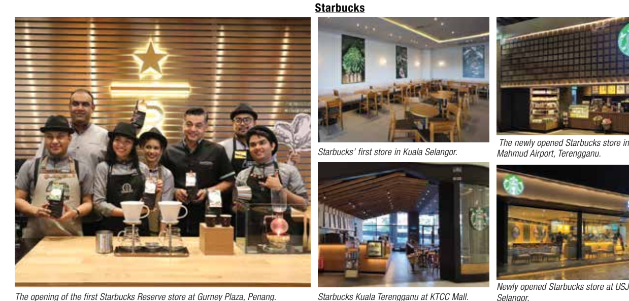
The opening of the first Starbucks Reserve store at Gurney Plaza, Penang.