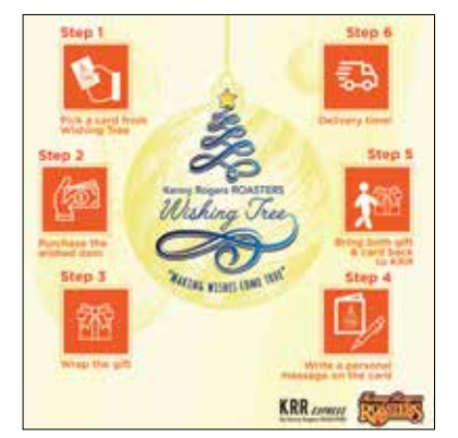
KRR's Wishing Tree campaign 2020.

Ringing in the year-end festive season, the 16th annual Wishing Tree campaign continued to fulfil wishes for underprivileged children across Malaysia. In 2020, Kenny Rogers Roasters ("KRR") aimed to fulfil wishes for more than 500 children from 15 non-government organisations ("NGOs") which had their 'Wishing Cards' displayed at participating KRR restaurants nationwide.