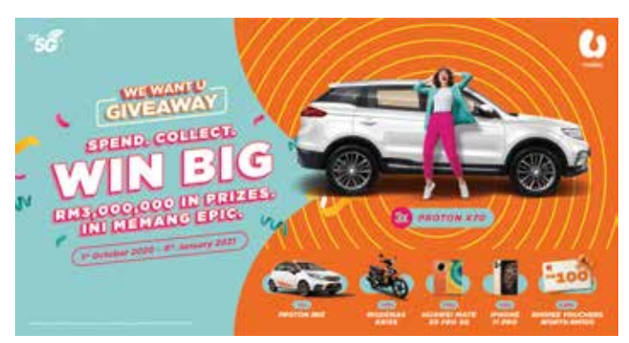
Promotional poster for the We Want U Giveaway Campaign.

To win, customers of U Mobile's prepaid or postpaid plans must accumulate the highest number of points during the daily, weekly or monthly tally by simply performing a variety of actions such as activating a new plan, upgrading their plans, purchasing data plans, boosters, top-ups or add-ons.