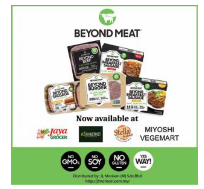
Beyond Meat products in Malaysia.

Beyond Dry Wok Kuey Teow were served at La Juiceria Superfoods, Super Saigon, Apollo Dining, and PC Studio Café. It will soon be made available at Sala and Real Food Café.