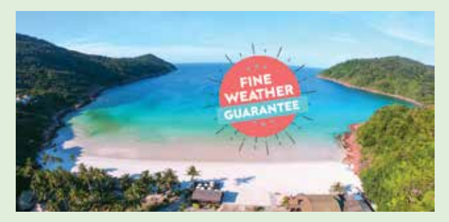
A promotional banner for the Fine Weather Guarantee offer.

The Taaras Beach & Spa Resort offers a fine weather guarantee to guests. Between 1 November to 28 February 2021, guests can opt for the Fine Weather Guarantee at RM200 nett upon booking. In the event where it rains continuously for 6 hours between 7am to 7pm during their stay, guests are entitled to receive a complimentary 1-night stay or an accommodation voucher valued at RM400, to be redeemed at any Berjaya Hotels & Resorts in Malaysia. For more information, kindly visit https://www.thetaaras.com/fine-weather-guarantee.