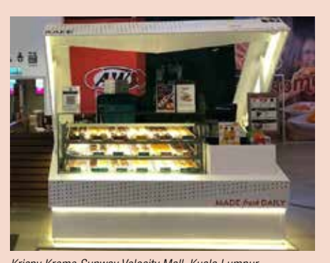
Krispy Kreme Sunway Velocity Mall, Kuala Lumpur.

Krispy Kreme's new outlet at Tropicana Gardens Mall, Kuala Lumpur.