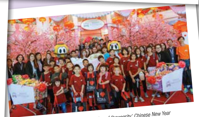
Berjaya Times Square Kuala Lumpur's 'Spring of Prosperity' Chinese New Year celebration with children from Rumah Charis.