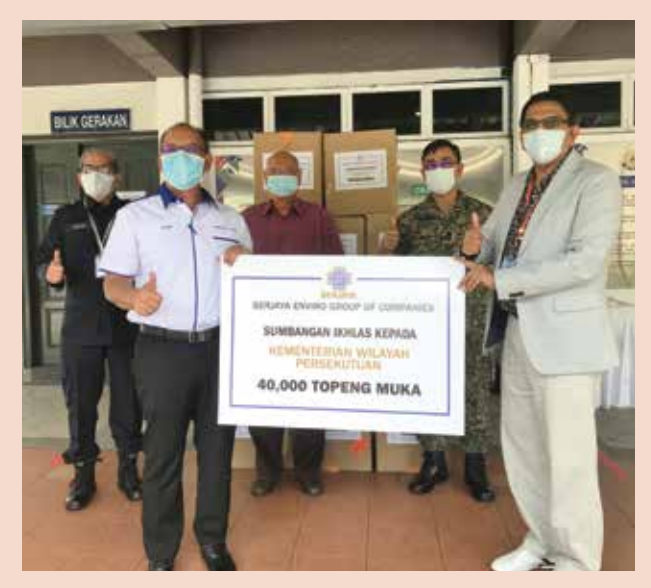
Berjaya Enviro donated a total of 130,000 pieces of face masks to the Ministry of Federal Territories, Ministry of Environment and Water, and the Minister of Housing and Local Government.