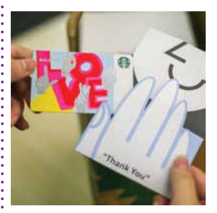
The special Signing "Love" Starbucks card.

In conjunction with Deaf Awareness Month, Starbucks Malaysia launched the Signing "Love" Starbucks Card on 1 September 2020. This exclusive Starbucks Card comes with a specially designed card sleeve which depicts the sign "Thank You" in the local sign language. The design was inspired by Ernest Ting from the Sarawak Society of the Deaf. This card can only be activated at Starbucks' Signing Stores at Bangsar Village 2, Kuala Lumpur, and Burmah Road, Penang.