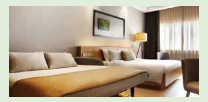
The new ANSA Executive Quadroom.

ANSA Hotel Kuala Lumpur announced the launch of its new room, featuring a king-sized bed and a super king size sofa bed which can accommodate up to 4 guests. Its new ANSA Executive Quadroom is most suitable for a family staycation in the heart of the city. On another note, a new Caring Pharmacy has just been opened along ANSA Walk. The pharmacy is located next to the entrance of ANSA Hotel Kuala Lumpur and is aimed at providing greater convenience to hotel guests throughout their stay.