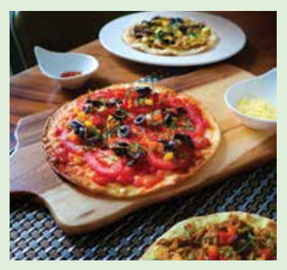
Oven baked thin crust margherita pizza pimientos, wild mushrooms and olives served at Berjaya Café.