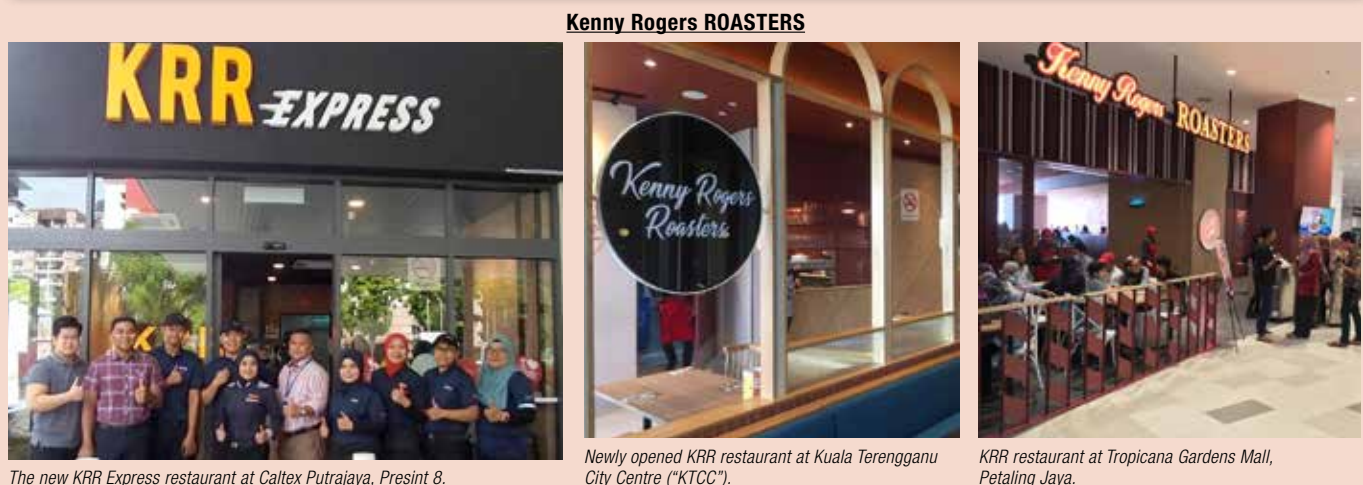
The new KRR Express restaurant at Caltex Putrajaya, Presint 8.