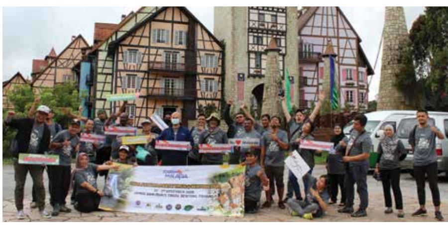
Tourism Malaysia Eastern Region and members of the media at Colmar Tropicale.

On 25 November 2020, Tourism Malaysia Eastern Region (Pahang) organised the 'Chillax Media Pantai Timur' FAM trip, in collaboration with Colmar Tropicale and several resorts at Janda Baik. 37 participants from Tourism Malaysia Pahang, RTM Pahang, Utusan Malaysia, Sinar Harian, Pahang Media Club, Malaysia Nanban, Makkal Osai, and other bloggers from Kelantan and Pahang participated in the trip which included a 2-day 1-night stay at Colmar Tropicale.