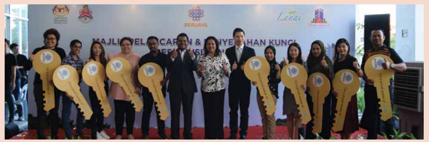
Key handover ceremony to the purchasers of Residensi Lanai.

On 25 February 2020, Berjaya Golf Resort Berhad, a subsidiary of Berjaya Land Berhad officially handed over the keys to purchasers of its first affordable homes project, Residensi Lanai in Bukit Jalil, Kuala Lumpur. Residensi Lanai is a 29-storey condominium with a 5-storey podium car park built on 2.56 acres of freehold land in Bukit Jalil. Each of its 648 units has a built-up area of 800 sq ft., comprising 3 bedrooms and 2 bathrooms. Some of the condo units enjoy a panoramic view of the Bukit Jalil Golf & Country Resort.