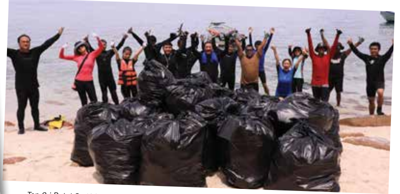
Tan Sri Dato' Seri Vincent Tan led a group of 20 employees to carry out a beach clean-up activity at Pulau Lima, Redang.