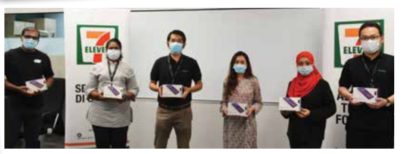
7-Eleven collaborated with NGOHub to sponsor Android tablets to women support NGOs, namely, Women of Will, Persatuan Ibu Tunggal Shah Alam and Persatuan Suri Rumah Rahman to aid single mothers, widows, abandoned or abused women living in poverty.