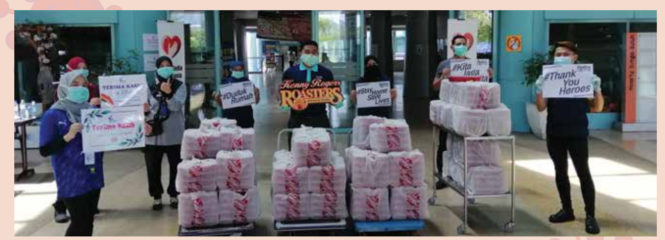
Kenny Rogers Roasters ("KRR") delivered 900 sets of Kenny's Quarter Meal (worth more than RM18,800) to frontliners at Sungai Buloh Hospital.