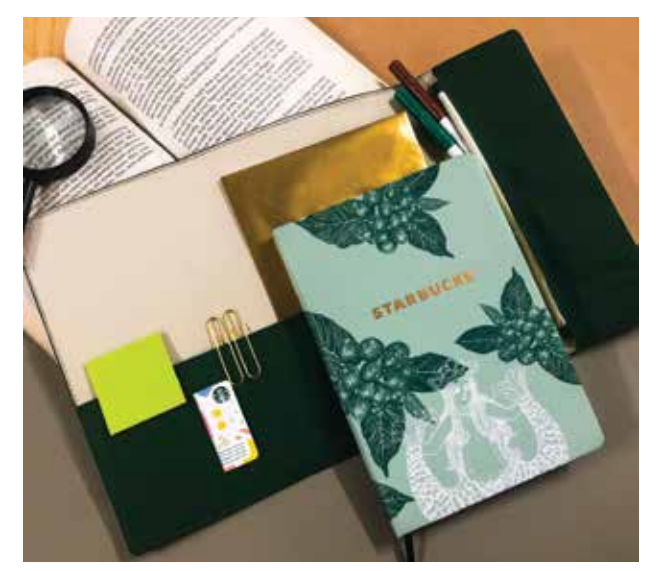
The 2021 Starbucks planner, now available for redemption or purchase.

The 2021 Starbucks planner has been launched! Made from vegan leather, this Malaysia-exclusive planner comes with several card slots, extra pockets, and a zipper slot to store stationery. The tri-fold planner sleeve also comes with an elastic band, completing the chic look. The 2021 Starbucks planner is redeemable with the purchase of 15 Grande or Venti beverages. Customers can also purchase it upfront for RM188.