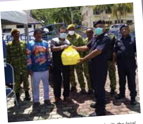
The Taaras Beach & Spa Resort collaborated with the local community or Redang Island to distribute packed food and mineral water to 25 frontliners at roadblocks around the island, consisting of Polis Diraja Malaysia and Malaysia Civil Defense Force personnel.