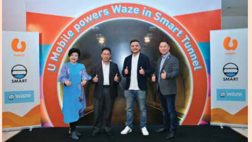
Launching of Waze Beacons right before the Movement Control Order (MCO) in March.

For the third year running, U Mobile was awarded Malaysia Mobile Service Provider of the Year at the 2020 Frost and Sullivan Asia Pacific Best Practices Awards. The telco also gained recognition in five categories under the 2020 Excellence in Customer Experience for the Telecommunications Industry in Malaysia, which included Overall Experience, Mobile Experience, Online Experience, Contact Center Experience and Dealership, bringing the total awards won to six.