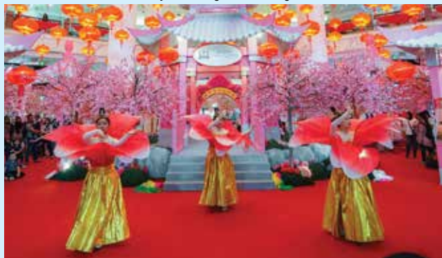
The Spring of Prosperity decoration at Berjaya Times Square, Ground Floor Central.

In recognition of 7-Eleven's momentous milestone of 71,100 stores opened across the globe, 7-Eleven Malaysia rewarded its customers with a series of daily in-store offers and special deals ranging from snacks, beverages to daily household necessities, from 7 to 11 July 2020.