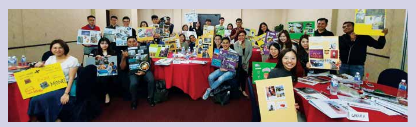
B.EDP participants attending Module 1 of the B.EDP programme at Bukit Jalil Golf & Country Resort.