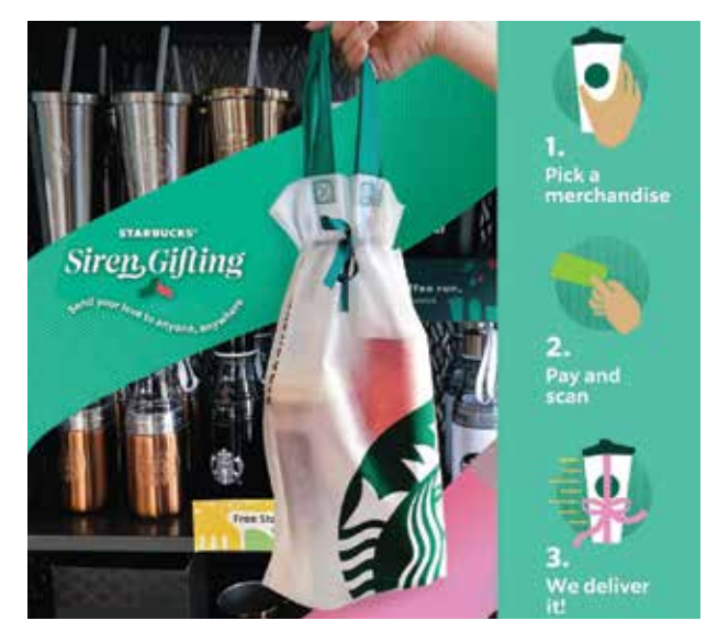
A promotional poster for Siren Gifting.

Starbucks Malaysia launched its Siren Gifting initiative, aimed at ensuring customers' gifts were delivered safely for the year-end holiday season. Customers could purchase gifts from participating Starbucks stores across Malaysia and Starbucks' partners would handle the packing, wrapping, and delivery. The gifts were also delivered along with a greeting card.