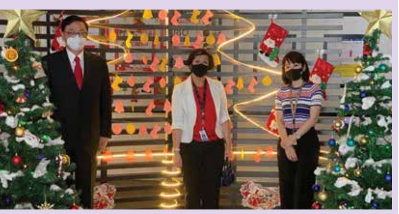
The launching of Spark Joy Charity Drive.