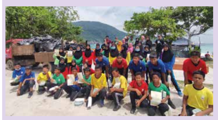
Volunteers at The Taaras Beach & Spa Resort with the collected waste ready to be transported to mainland Kuala Terengganu.