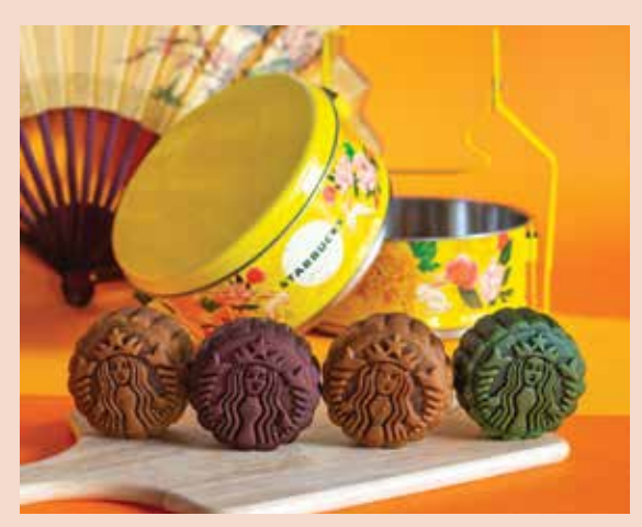
The Starbucks Malaysia Exclusive Mooncake set.

The mooncake flavours were inspired by Starbucks' handcrafted beverages, namely the Chocolate Lava Mooncake, Mocha Lava Mooncake, and returning favourites, Green Tea Key Lime Mooncake, and Tiramisu Mooncake.