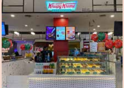
Krispy Kreme Paradigm Mall, Petaling Jaya.