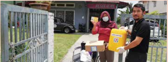
7-Eleven Malaysia in collaboration with NGOHub distributed hand sanitisers, multivitamin supplements, and antibacterial household cleaning products to charitable homes, including Pusat Jagaan Sri Mesra, Persatuan Kebajikan Rumah Victory, Aiyide Old Folks Home and also other charitable homes.

Published by Berjaya Corporation Berhad (554790-X), Corporate Communications, Level 12, West Wing, Berjaya Times Square, 1 Jalan Imbi, 55100 Kuala Lumpur. Printed by Percetakan CL Wong Sdn Bhd, No A5-84, Jalan Hang Tuah 4, Taman Salak Selatan, 57100 Cheras, Kuala Lumpur