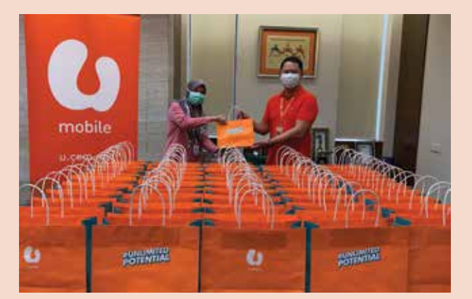
U-Mobile contributed 100 new mobile phones with 100 GX68 postpaid SIMs to University Malaya Medical Centre and Sungai Buloh Hospital. The mobile phones and SIMs with unlimited high-speed data and calls were used to reach out to patients under investigation and to conduct contact tracing.