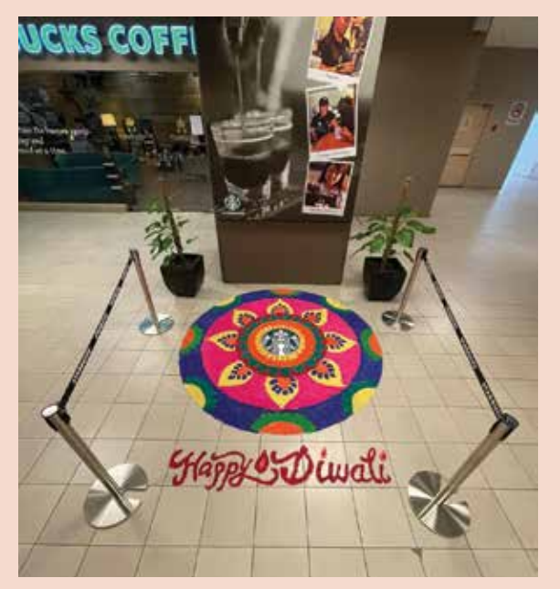
The completed Kolam on display at the Starbucks Support Centre.

In conjunction with Deepavali, Starbucks Partners at the Starbucks Support Centre took some time off their busy schedule to create a Kolam artwork inspired by the design of the 2020 Deepavali Starbucks card.