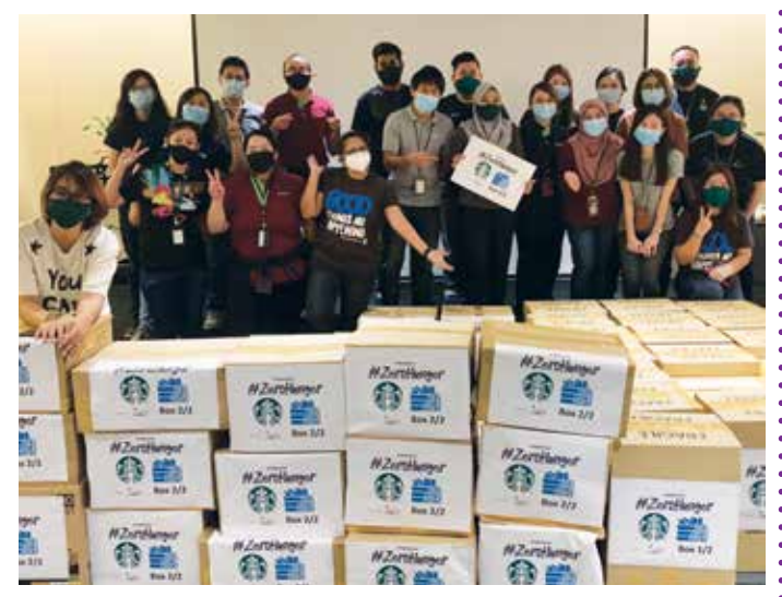
Starbucks partners who volunteered for the packing of daily necessities.

Starbucks Malaysia partnered with The Lost Food Project to distribute groceries and household rations to 32 underprivileged families in Kuala Lumpur. Over the course of 2 weeks, Starbucks Malaysia collected essential food items, which included bags of rice, noodles, biscuits, canned food, laundry detergent, toothpaste, and face masks. 20 Starbucks Support Centre partners helped pack these items into boxes on 6 November 2020, which were subsequently distributed to the beneficiaries.