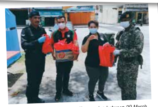
7-Eleven's "Lend a Helping Hand" campaign between 29 March to 28 April 2020 channelled supplies and daily necessities to government hospitals, medical clinics, civil services, charity homes, public universities, and student dormitories