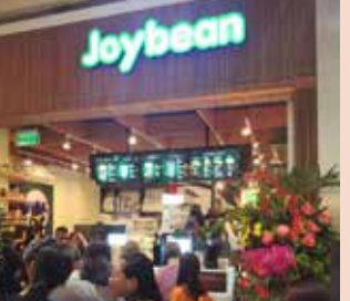
Joybean's 4th and 5th outlets at Tropicana Gardens Mall Kuala Lumpur (left) and SM City San Lazaro, Manila, the Philippines.