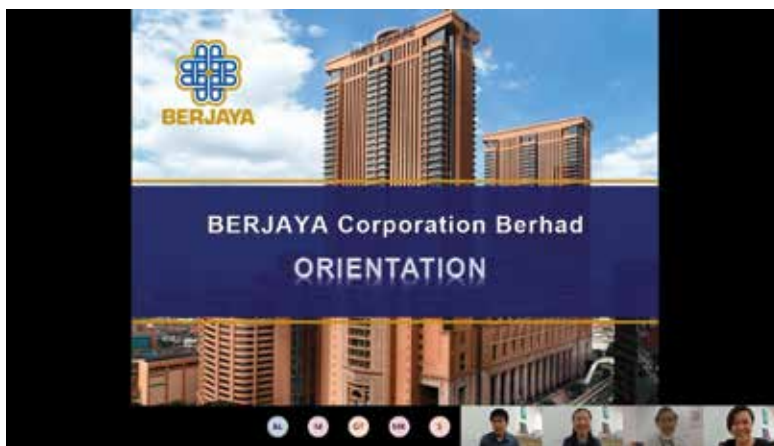
A virtual group photo with the new employees.

A virtual orientation session was conducted for 8 new colleagues from Berjaya Corporate Office and Property Division on 14 May 2020.