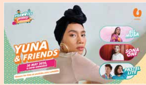
#GroovesWithU Raya Special