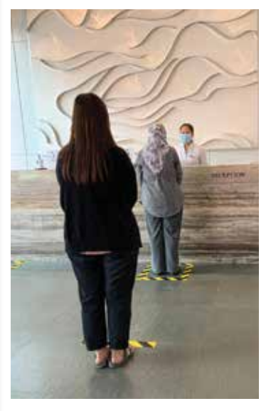
Social distancing markers at ANSA front desk.

On 4 May 2020, ANSA Hotel Kuala Lumpur reopened its doors when restrictions on the Movement Control Order were loosened. Operations resumed with new health and safety measure to minimise risk for guests and associates.