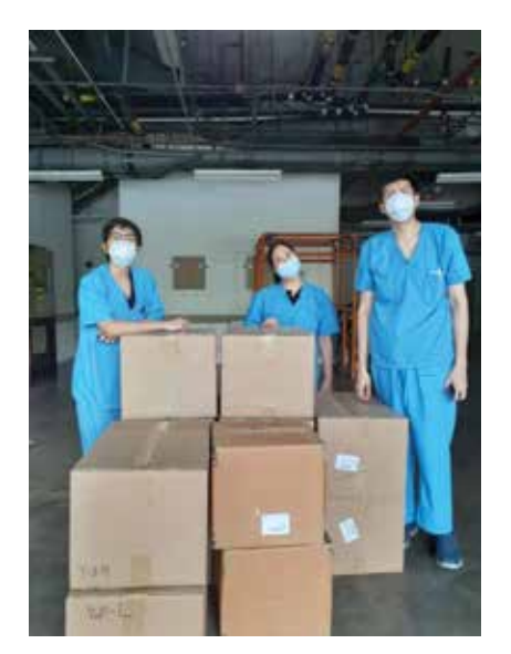
Frontliners of The Medical City receiving the PPE donated

As the Covid-19 pandemic sweeps across the world, the role of private sectors is made even more significant even when businesses are taking a step back during the crisis.