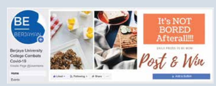
Social media campaign for BUC students during the MCO.

BUC would like to express their gratitude to the Ministry of Higher Education who provided the funding for the daily necessities to ensure the welfare of students were taken care of during the MCO period.