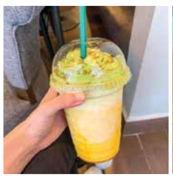
Caramel Sweet Corn Crème Frappuccino.

To make Ramadhan even more special, Starbucks Malaysia also introduced its Chewy Kurma Cookies. These cookies are a classic spin on the regular oatmeal cookies, made with kurma (dates), rolled oats with a hint of cinnamon and packed in a box of four.