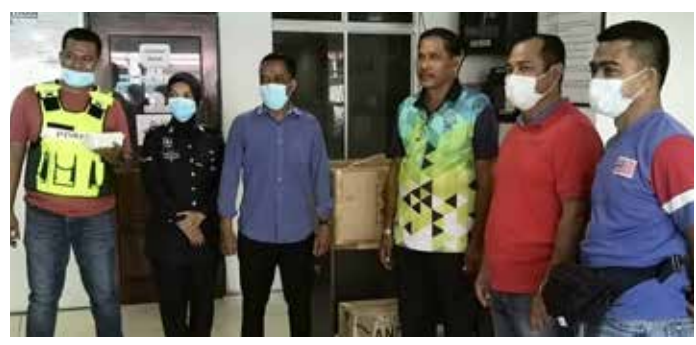
Representatives from Berjaya Penang Hotel handing over the packed food to police officers.

Meanwhile, on 20 April 2020, representatives from Berjaya Penang Hotel distributed packed food and mineral water to police stations in the Georgetown area, including Balai Polis Pulau Tikus, IPD Timur Laut and Balai Polis Central.