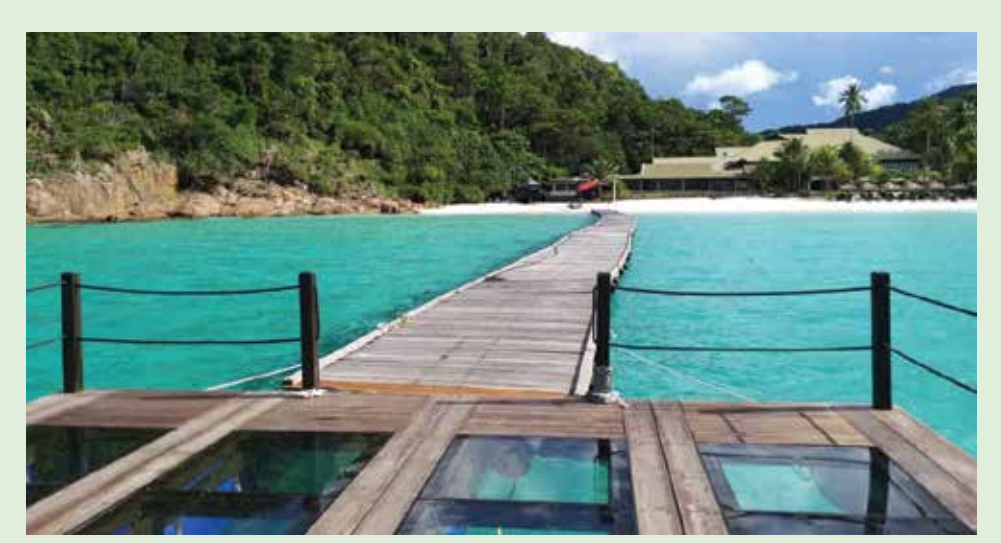
Breath-taking view from the pontoon, overlooking the resort complex.

Visitors to The Taaras Beach & Spa Resort now have an extra Insta-worthy to take at its newly opened pontoon with an attached glass platform to take in magical views of the ocean beneath. This new attraction is also an ideal spot for sunset dinners. special occasions, and а perfect place for marriage proposals!