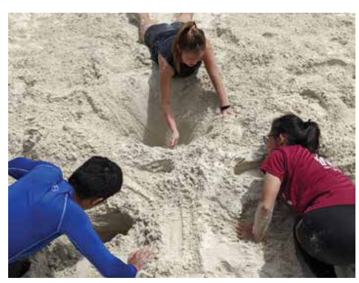
The SEATRU team hard at work collecting turtle eggs buried in the sand.

SEATRU Turtle Lab at The Taaras Beach & Spa Resort was founded in 2018 as an effort towards sea turtle conservation and as an educational facility to increase awareness towards the plight of the sea turtle. The lab is managed by The Taaras' Beach & Spa Resort's very own marine biologist who works with a team of SEATRU scientists and trained research assistants from Universiti Malaysia Terengganu.