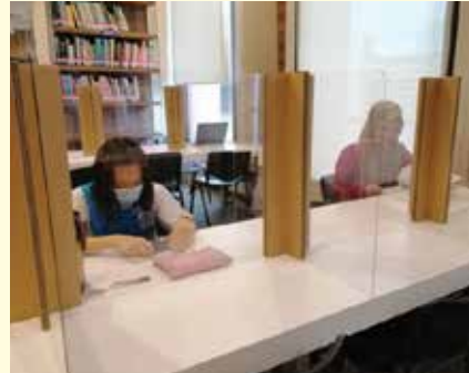
Staff and students at Berjaya University College are required to check-in via a QR code before entry. Acrylic boards were also placed between seats in the library to prevent direct contact