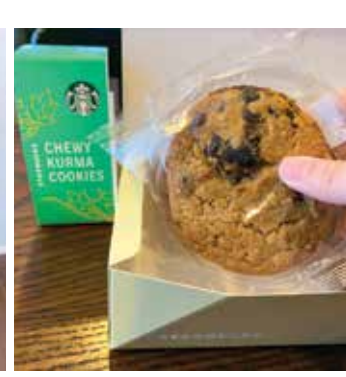
Chewy Kurma Cookies.