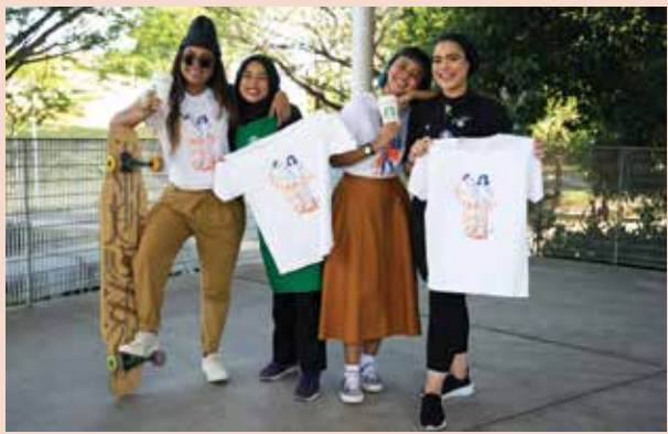
Starbucks Malaysia collaborated with Oh Sebenar and WOMEN:girls on the #HeresToUs campaign.

Apart from that, Starbucks also highlighted stories of several Starbucks' partners and female customers' on its social media.