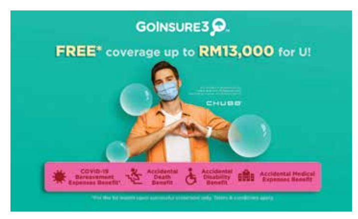
Golnsure 3 Insurance Coverage

The third promotion will see customers receiving a free upgrade to an iPhone 11 128GB when they purchase the iPhone 11 64GB with either Unlimited HERO P139 or Unlimited HERO P99. U Mobile is aware that its customers are affected by the pandemic in one way or another, and is working hard to provide relevant support to all.