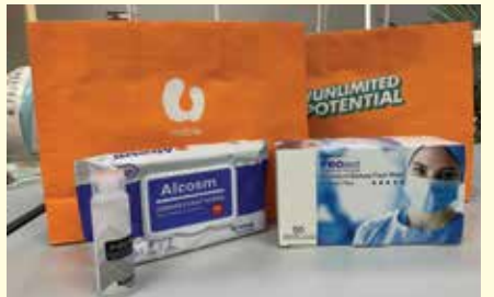
U Mobile provides care packs consisting of face masks, hand sanitizers and alcohol wines for employees while customers entering a U Mobile store must wear a mask and adhere to the usual SOP