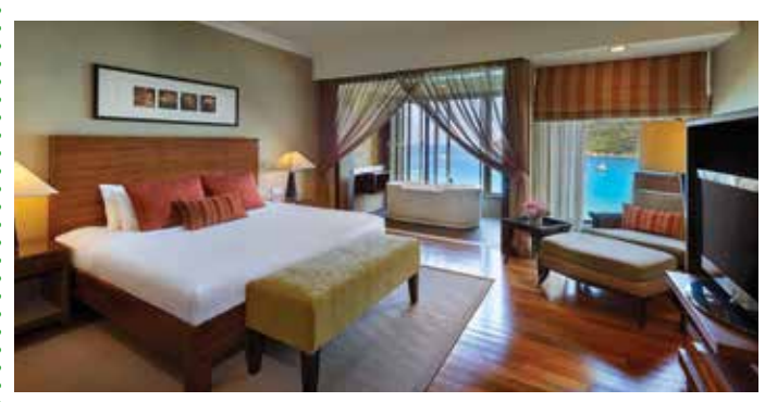
The cliff premier suite at The Taaras Beach & Spa Resort.

On 1 April 2021, The Taaras Beach & Spa Resort introduced new room packages. Available for couples, families, friends, and divers, the packages feature new inclusions, such as food and beverage credit worth RM300 nett per day, daily recreational activities, sunset cocktail sets with canapes, and resort merchandise.