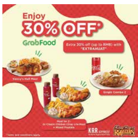
Offer via GrabFood from 18 January to 7 February 2021.