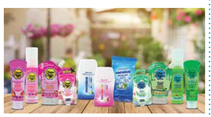
A range of Chupa Chups personal care products.

Chupa Chups personal care products are now available at 7-Eleven Malaysia! Widely known for its lollipop and confectionery products, Chupa Chups' first foray into personal care products include hand and nail creams, body lotion, and shower gel. Available exclusively at selected 7-Eleven stores in Peninsular Malaysia.