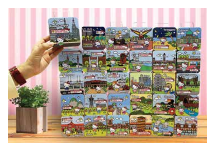
Hello Kitty VISIT MALAYSIA collectible tins.

This one-of-a-kind collection comes in 30 adorable designs, each featuring an iconic place of interest which represents all states and federal territories of Malaysia. Customers will be rewarded with a sticker for every purchase of RM5 in a single receipt at any 7-Eleven Malaysia outlets from 8 March until 2 May 2021. A bonus sticker will be rewarded if the purchase includes a partner product from Goodday, Mentos, 100Plus, P&G, Nestle, and Mi Sedaap. A Hello Kitty VISIT MALAYSIA collectible tin is redeemable for free with a total of 15 stickers. Alternatively, customers can also purchase a collectible tin at RM9.90 with only 8 stickers.