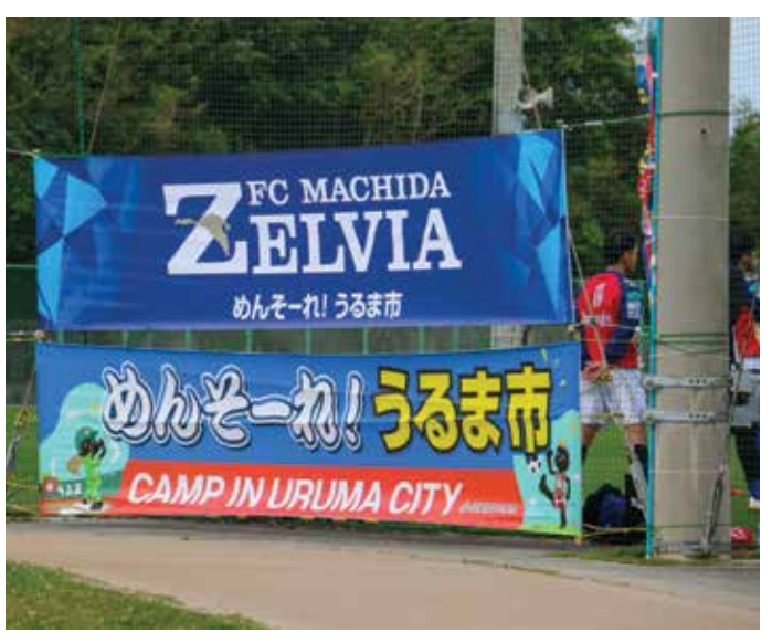
Banners welcoming the teams of professional athletes at ANSA Okinawa Resort.