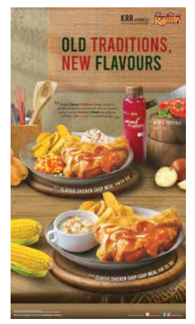
KRR's Old Traditions, New Flavours promotional poster.

Get a FREE 13.5" ceramic rectangle plate worth RM18.90 when you purchase Kenny's Kitchen Inspirations "Frozen-Ready to-Cook" products at http://krr.alacarte.my/ (with min purchase of RM30 in a single receipt. While stocks last)