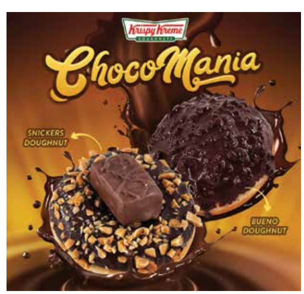
Krispy Kreme's Chocomania features the Snickers and Bueno doughnuts.