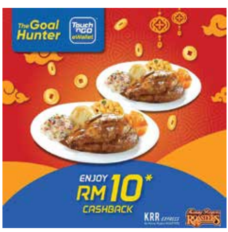
Touch N Go-The Goal Hunter programme, February 2021 offer.