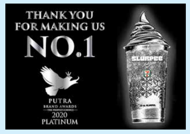
7-Eleven Malaysia wins Platinum Award in retail category at Putra Brand Awards 2020.

7-Eleven Malaysia was once again recognised as one of the most trusted brands on 5 February 2021 when it received the Platinum Award in the retail category at the Putra Brand Awards 2020. This marked 7-Eleven Malaysia's 6th consecutive win for the Putra Brand Award since 2015. The win was an exemplification of customers' trust and confidence in the brand, solidifying its position as the top retailer.