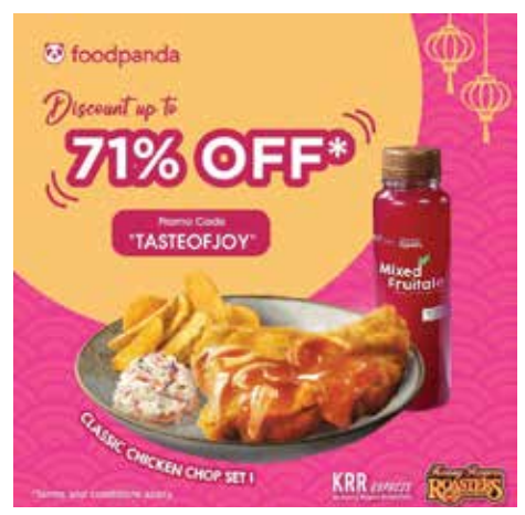
Offer via FoodPanda from 6 January to 2 March 2021.