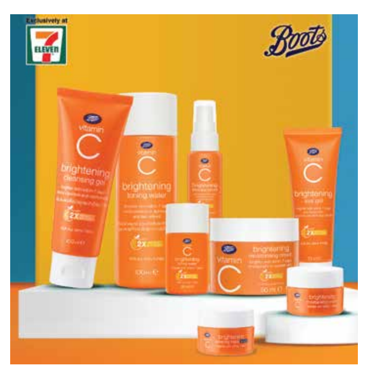
Over 40 products under the Boots brand are available exclusively at 7-Eleven stores.

The UK's No.1 skincare brand, Boots, is now available in selected 7-Eleven stores. Products include Boots vitamin C brightening selection, Boots cucumber series, Boots Korean sheet mask collection, Boots hair & body products, and Boots sun protection range. Prices start at RM6.90 across all product variants.