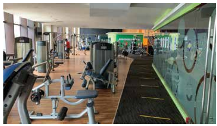
Interior of Sports Toto Fitness Centre.

Sports Toto Fitness Centre ("STFC") is back! In compliance with the new SOP issued by Kementerian Belia Dan Sukan and Majlis Keselamatan Negara, all entry into the club must be by appointment only. Don't forget to call us at 03 2148 2626 to prebook your slot 24 hours ahead of time. Total club capacity at any time remains at 50 pax until further notice.