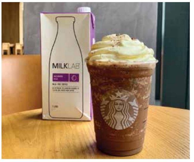
Ayesha Dahalan, Starbucks Malaysia's Coffee Specialist during a Coffee Seminar session.

In light of the growing plant-based milk trend, Starbucks Malaysia launched its macadamia milk option as a new addition to their menu in January 2021. The move follows the company's global initiative to be a resource positive company, where macadamia milk joins three other alternative milk options currently available at Starbucks outlets, namely, soy, almond, and coconut. With the positive response from customers, Starbucks is aiming for the launch of its oat milk next month.