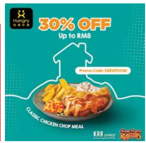
Offer via Hungry until 17 January 2021.