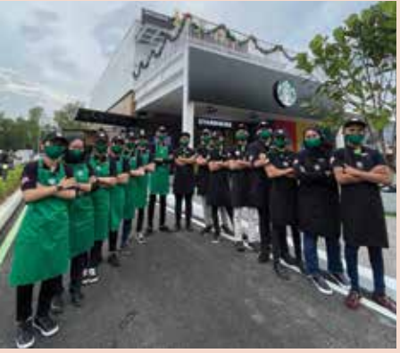
Damansara Avenue, Kuala Lumpur.