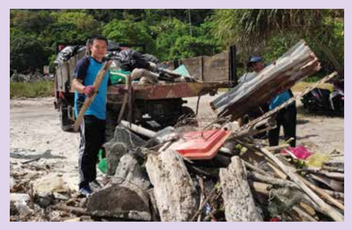
Collected waste being loaded into a lorry for disposal.

Three lorry loads of rubbish were collected, consisting of plastic, polystyrene, rubber, and wood. The Taaras Beach & Spa Resort strives towards environmental preservation, encouraging local villagers and school children to participate in their clean-up activities as well.