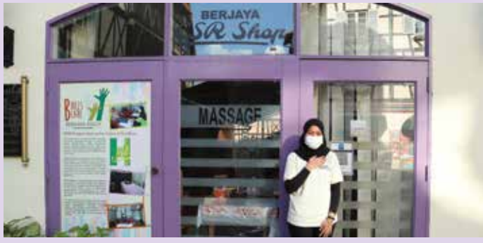
The MAB shop at Colmar Tropicale.

In January 2021, to empower individuals afflicted with visual impairment, Colmar Tropicale supported the Malaysian Association for the Blind ("MAB") by offering full-time employment to blind masseurs at the resort. Visitors and guests are welcome to support their massage services at Colmar Tropicale.