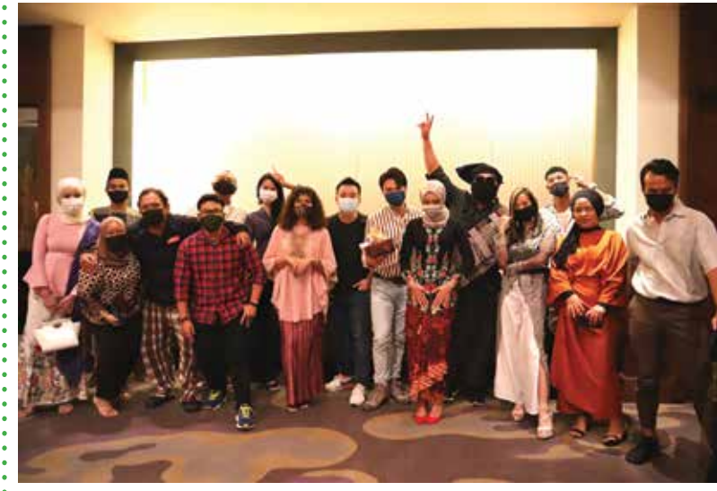
Media friends at the BTHKL buka puasa food review.

On 17 March 2021, Berjaya Times Square Hotel, Kuala Lumpur ("BTHKL") invited 30 members of the media from mainstream news and magazine agencies, digital marketing agencies, KOLs and celebrities to sample BTHKL's buka puasa buffet offerings. Dishes included marinated whole lamb, briyani, Kedah curry fish head, assam pedas and many more Malay dishes. This year's Ramadan buffet will feature a classic 60s theme where guests can listen to their favourite artists from the 60s while enjoying a wide spread of Malay dishes.