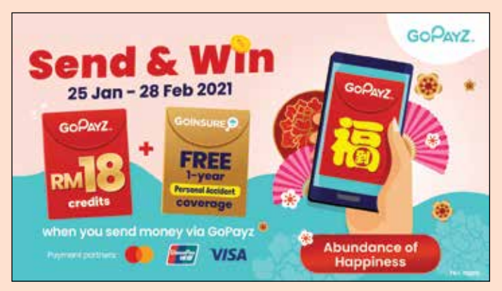
Promotional poster for GoPayz "Fu Dao" Chinese New Year Campaign.

GoPayz, the universal standalone e-wallet developed by U Mobile celebrated Chinese New Year with its 'Fu Dao' (福到, meaning "luck has arrived") campaign. As part of the campaign, every user who gifts an e-angpow to family and friends using the Peer-to-Peer (P2P) transfer feature on the app between 25 January to 28 February 2021 stands a chance to win 1-year free subscription of Golnsure Personal Accident insurance, RM18 GoPayz credit, or both.