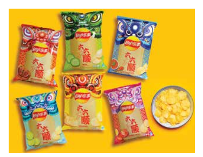
Lay's Chinese New Year edition potato chips.

In conjunction with Chinese New Year celebrations, Lay's launched its limited edition packaging series, featuring 6 different flavours: lime, Mexican chicken tomato, Texas grilled BBQ, Italian red meat, American classic, and cucumber. Each pack featured a unique design for Chinese New Year and was available at selected 7-Eleven stores in Peninsular Malaysia at RM4.90 each.