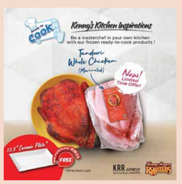
KRR's Kenny's Kitchen Inspirations Marinated Tandoori Chicken.