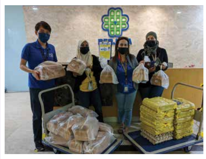
Staff members collecting the purchased items.

Products available include kampung eggs, Benggali bread, and batik face masks.