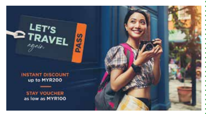
The Let's Travel Again Pass by BHR.

On 5 March 2021, Berjaya Hotels & Resorts ("BHR") introduced its Let's Travel Again Pass ("LTA Pass") to encourage domestic tourism. With BHR's LTA Pass, travellers can enjoy instant discounts of up to RM200 on room bookings, or purchase stay vouchers for as low as RM100 for future stays. The LTA Pass campaign ran till 12 April 2021, with bookings valid for stays until 31 December 2021.