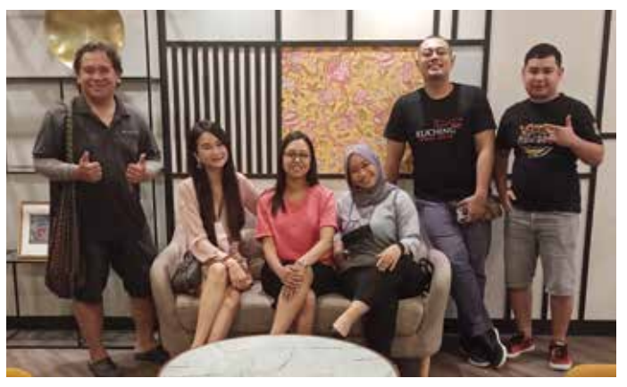
The media with staff of Berjaya Hotels & Resorts.