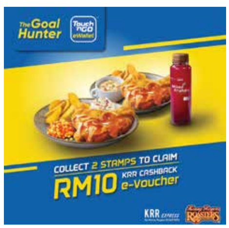
Touch N Go-The Goal Hunter programme, January 2021 offer.

In the first quarter of 2021, Kenny Rogers ROASTERS ("KRR") offered several e-wallet offers through Touch N Go and Shopee Pay. KRR also offered promotions through its online delivery partners, FoodPanda, GrabFood, and Hungry for customers who prefered to dine in their own homes.