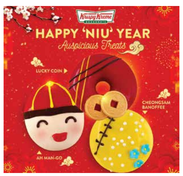
Krispy Kreme introduced 3 new doughnuts for Chinese New Year, the Lucky Coin, Ah Man Go, and Cheongsam Banoffee.