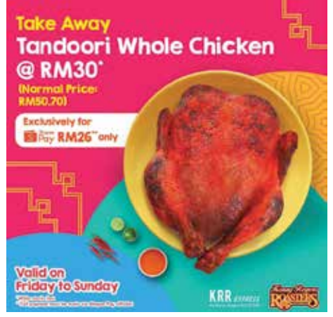
Take Away Tandoori Whole Chicken for only RM26 with Shopee Pay.