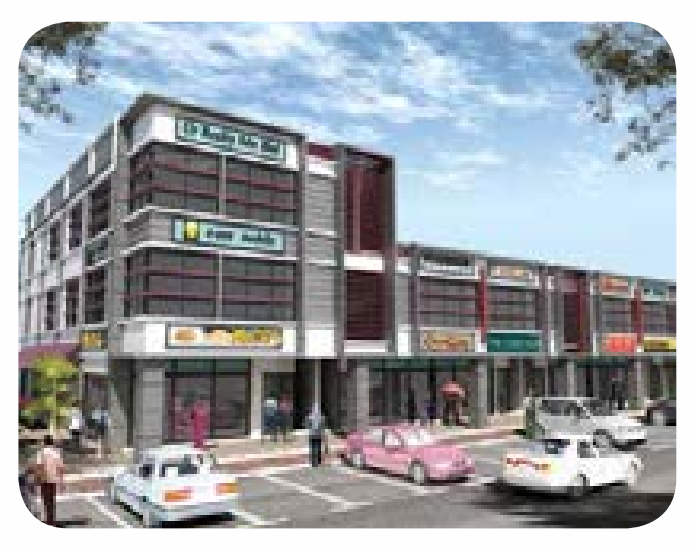
Trade Point at Berjaya Park, Shah Alam.

The Corporate Suites created significant headlines with the signing of Bangkok Bank as the anchor owner of the development valued at RM100 million in December 2011. Bangkok Bank, one of the oldest and most established financial institutions in the country is taking up eight levels of the corporate suites as well as commercial space on the ground and mezzanine floors for its banking hall. The Corporate Suites was renamed Menara Bangkok Bank @ Berjaya Central Park.