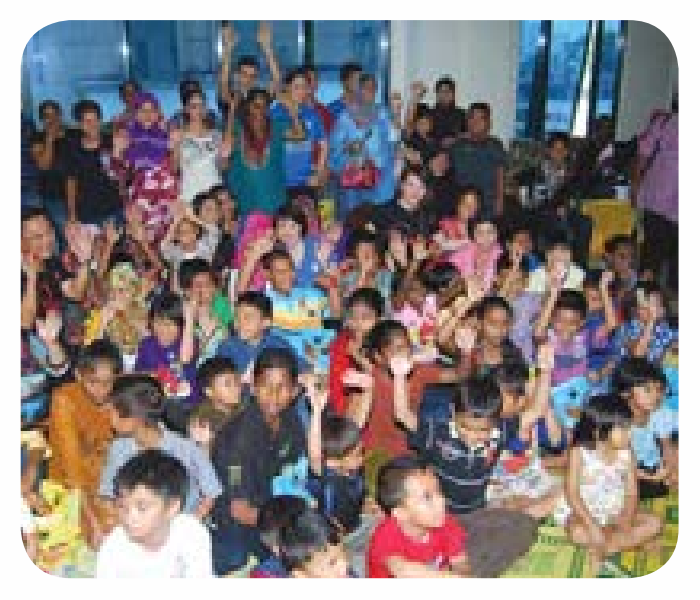
Berjaya Cares Foundation supported PT Foundation's Backto-School programme for 100 children living with or affected with HIV.

Chairman / Chief Executive Officer 18 September 2012