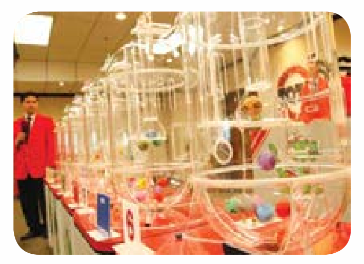
A Sports Toto draw in progress.

The Proposed Transfer and Proposed Listing are subject to other relevant authorities' approvals.