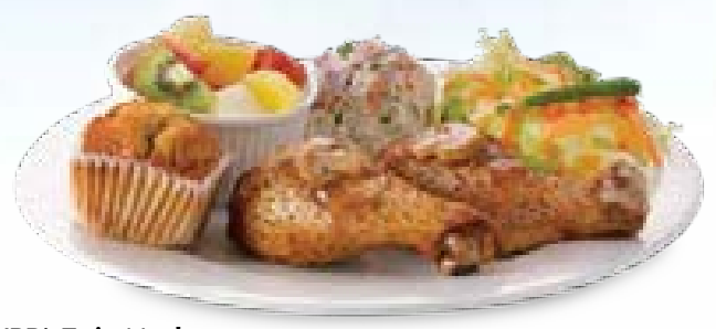
KRR's Twin Meal.