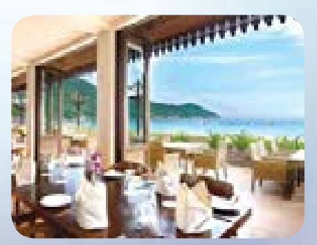
The Taaras Beach & Spa Resort, Redang Island, Terengganu.