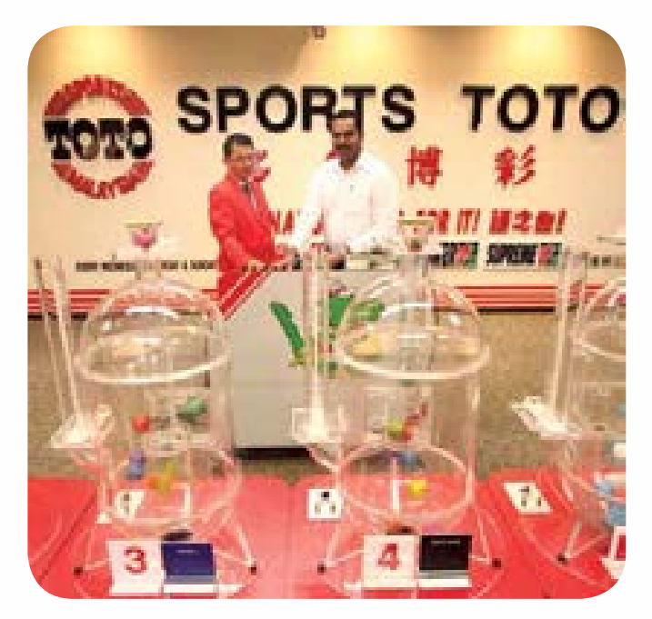
A Sports Toto draw in progress.

During the financial year under review, the Supreme Toto 6/58 game recorded the highest Jackpot in Sports Toto's history of RM57.18 million when it was struck on 18 January 2012. The record Jackpot of RM57.18 million was also the highest ever Jackpot recorded in Malaysian history.