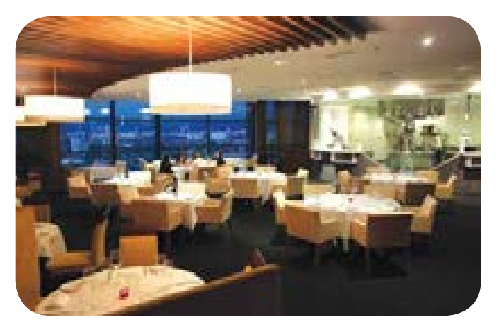
Samplings on the Fourteenth – Berjaya Times Square Hotel, Kuala Lumpur.