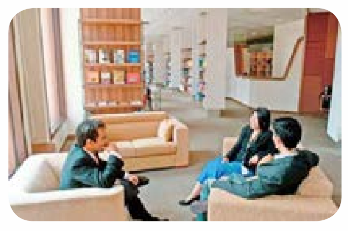
Library - Berjaya UCH.

The Malaysian international education sector has grown tremendously during the past decade and Malaysia is fast becoming a centre of educational excellence in the region as the Government aims to boost the economy by promoting Malaysia internationally as an education destination. With the rapid growth of the education industry, prospective students are faced with a huge selection of institutions and courses. Despite the competitive environment, Berjaya UCH is now recognised as one of the top choices among Hospitality and Culinary institutions in Malaysia. Besides its star Hospitality and Culinary courses, Berjaya UCH also offers courses in Events, Retail and Business which will help the institution to counter the competitive environment.