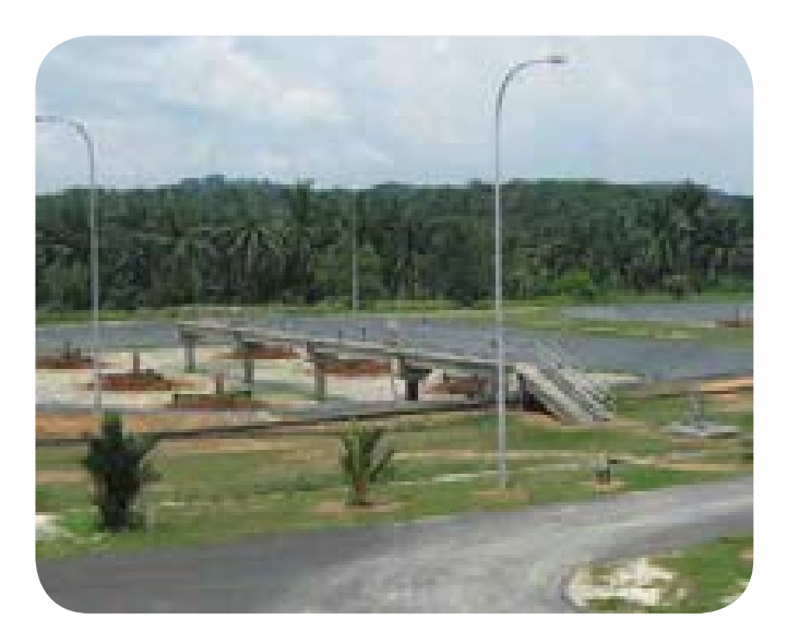
Leachate treatment plant, Bukit Tagar Sanitary Landfill, Selangor.

The project is divided into five phases and construction started in 2010. Phase 1 Landfill Cell together with its operation office, staff quarters, workshop and all ancillary facilities were completed and became fully operational since April 2011. The Landfill is equipped with an advanced leachate treatment plant and state-of-the-art landfill site management system. BEE commenced receiving municipal wastes from the Sanshui District since May 2011. In July 2012, the Guangdong Provincial Government conferred the landfill the status of '1st Class Sanitary Landfill'. It is the only facility to be granted this status in the Foshan region.