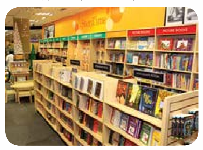
Interior - Borders Bangsar Village II, Kuala Lumpur.