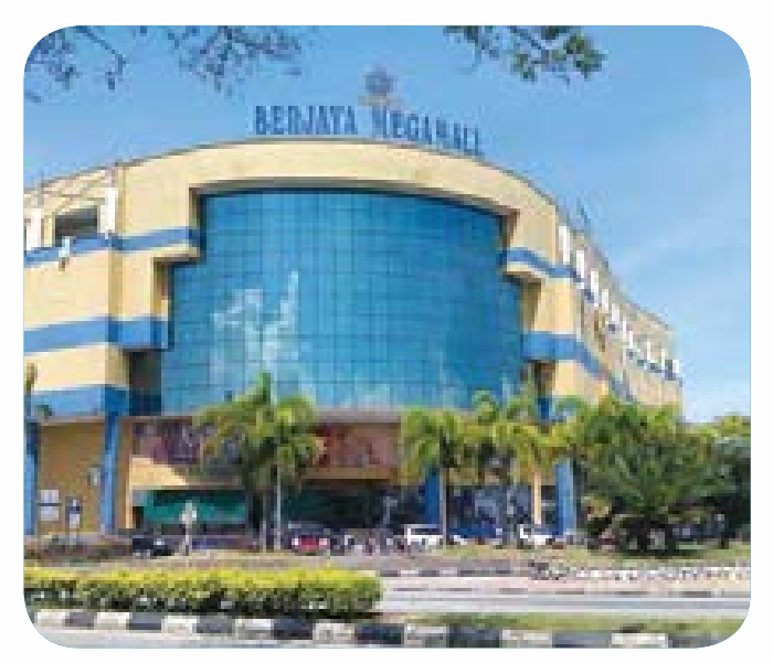
Berjaya Megamall, Kuantan, Pahang.

Berjaya Megamall, Kuantan was able to maintain its high occupancy rate with its all year round promotional activities and events. These promotional activities and events were arranged and designed to always stay current with the latest fashion/retail trends and happenings in Kuantan, which in turn attracted more shoppers and retailers to the complex.