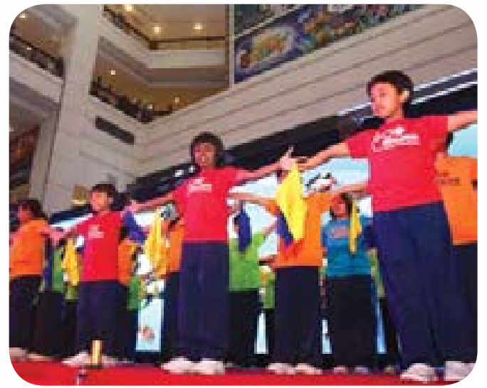
Children of Harvest Centre performing during BFD 2012.