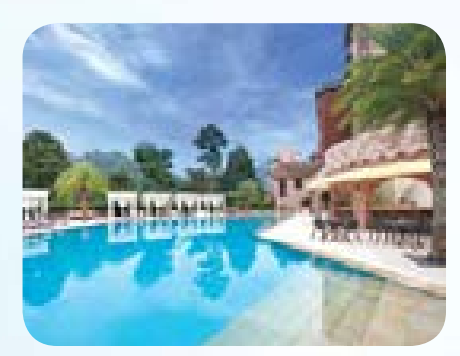
Salt Pool - The Chateau Spa & Organic Wellness Resort, Berjaya Hills, Pahang.