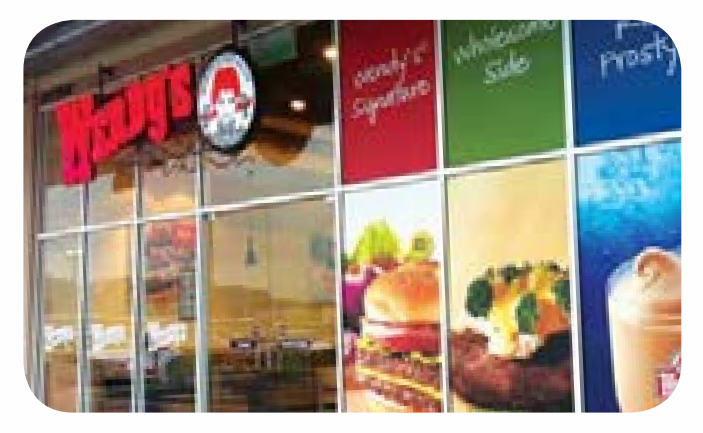
Wendy's outlet at AEON Rawang, Selangor.

Wen Berjaya will continue to focus on expansion by opening new outlets in key market areas, to grow revenue through aggressive marketing campaigns to increase market share via new and repeat customer visits, and the introduction of attractive seasonal promotions.