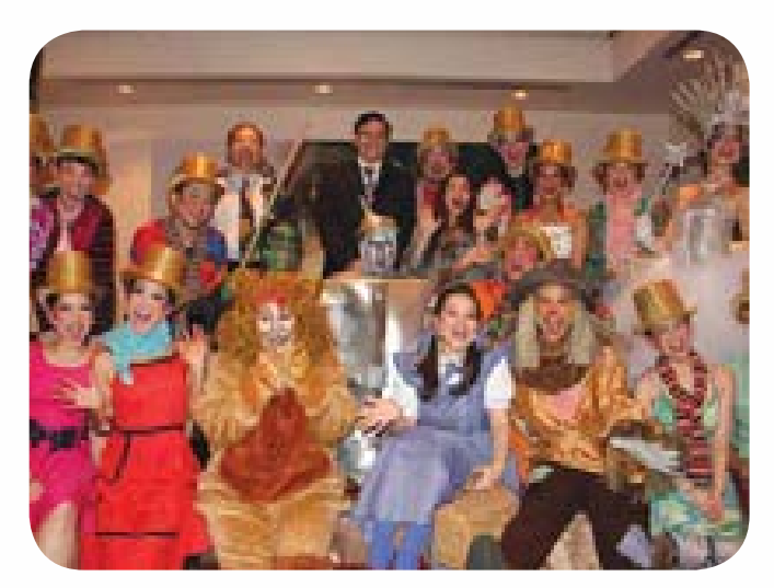
BCorp supported the local production, Wizard of Oz – The Musical.