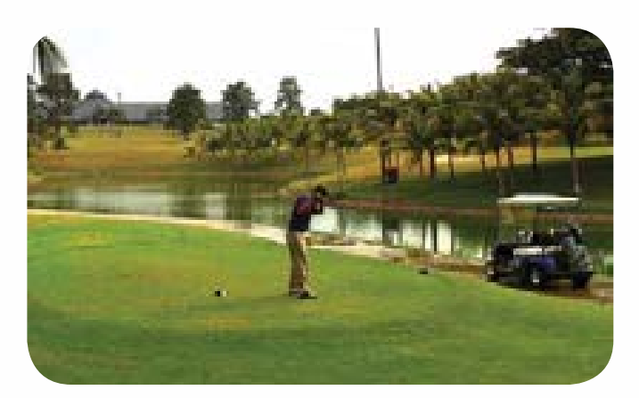
Staffield Country Resort, Negeri Sembilan.