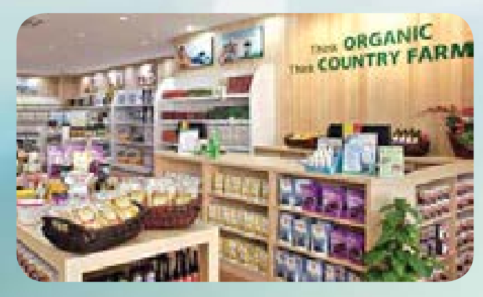
Country Farm Organics.