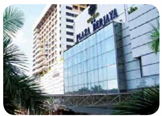
Plaza Berjaya, Kuala Lumpur.