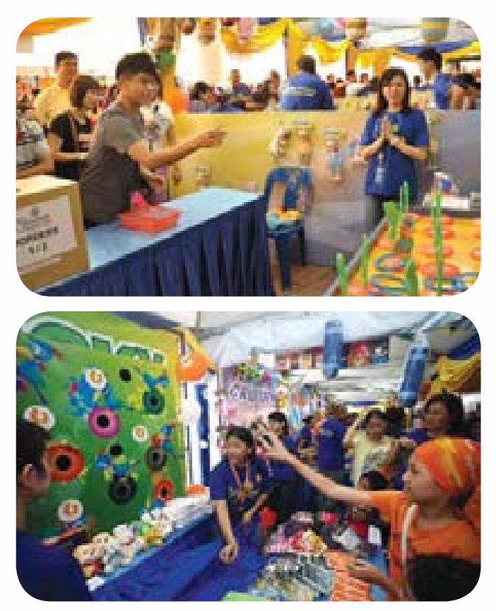
Fun and games for young and old alike.

In addition, approximately 400 underprivileged children from Rumah Amal Limpahan Kasih, Yayasan Chow Kit, Harvest Centre, Rumah Kanak-Kanak Yang Ingin Disayangi and Tara Bhavan were invited for an outing at Berjaya Times Square Theme Park.