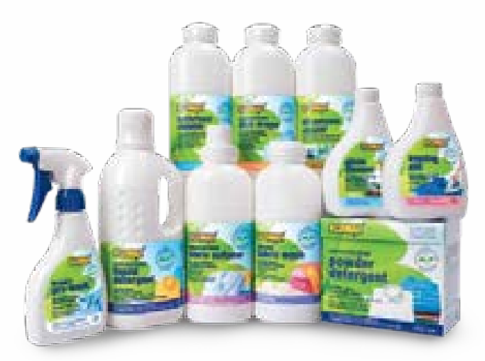
Cosway's range of Ecomax products.

The group's strategy in building a wide network of physical retail chain stores in Mainland China had continued to generate tremendous followings. The first physical retail store was finally opened in December 2011 in Tianjin City under the 'Vmart' brand and received overwhelming response. The 'hybrid retail stores' expansion programme continued to be the group's operating platform, enabling it to penetrate into new markets in Latin America (namely Colombia and Mexico) and Russia towards the end of the financial year. The new debutant countries, United States of America, New Zealand, Japan and the United Kingdom, which the group had embarked into in the second half of the last financial year and now have more than 120 new 'hybrid stores' which are fully operational, had registered moderate but steady growth amid the less than favourable economic conditions that still persist in the respective locations.