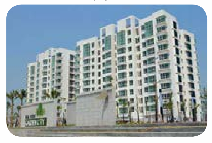
Canal Park, Ha Noi Garden City, Hanoi, Vietnam.

The Division's development project in Yanjiao, China , Berjaya Great Mall of China is also gradually making headway with progress recorded for the first phase of its development. Berjaya Great Mall of China consists of 10 main adjoining blocks of retail lots, hotels, offices and serviced suites. Located in Hebei Province, it is approximately 30 minutes' drive from Beijing's Central Business District and is being built over a land area of 76 acres.