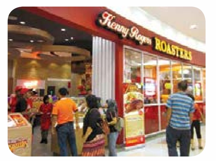
KRR outlet at AEON Ipoh Station 18, Perak.

KRR has also expanded its reach and convenience to its customers through its delivery and outdoor catering services. Roasters Catering and Delivery delivers quality and wholesome meals right to the doorstep at selected areas in East and West Malaysia. The Roasters On The Move mobile restaurant has the capacity of serving up to 200 guests with hot and wholesome KRR meals.