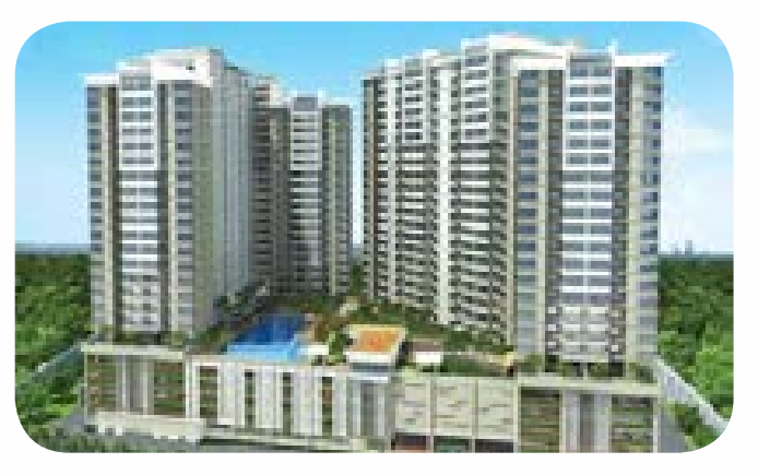
Covillea Condominium, Bukit Jalil, Kuala Lumpur.

Slated to be completed within 5 years and with a total built-up area of 18.5 million sf, the RM7.5 billion Berjaya Great Mall of China will be the world's biggest integrated mall complex upon completion.