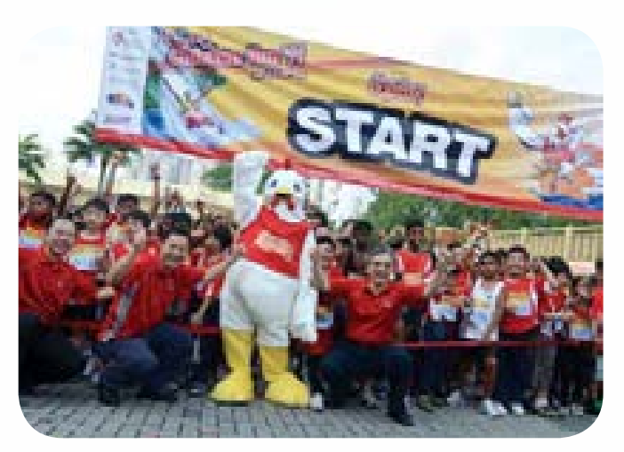
Roasters Chicken Run 2011.