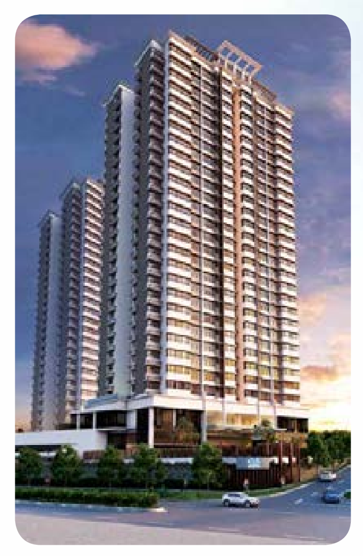
KM1 West Condominiums, Bukit Jalil, Kuala Lumpur.