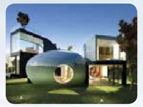
Atelier 1 - Berjaya Jeju Resort, Jeju Island, South Korea.