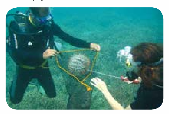
Divers removing the reef-destroying Crown of Thorns during the Tioman Island Clean-Up held in May 2011.