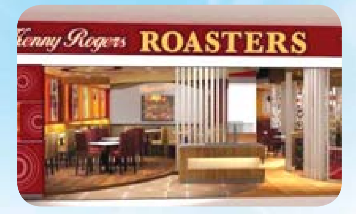
KRR outlet in Nanhai Plaza, China.