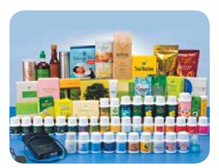
Cosway's range of healthcare products.