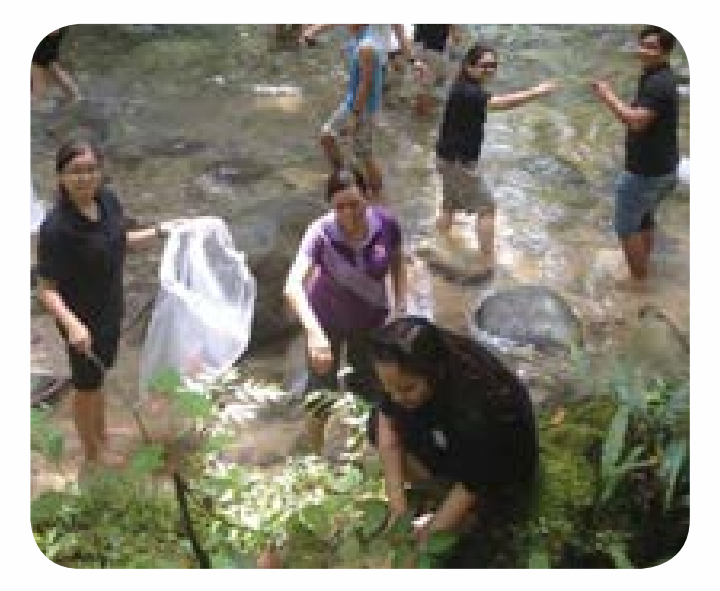
River clean-up - one of the activities carried out during Starbucks' Global Month of Service.

Through RAP, the KRR brand is also aggressively expanding into other selected international territories namely Southern China, India, Thailand, Middle East and the Eastern Seaboard of the United States of America through franchising and joint ventures.