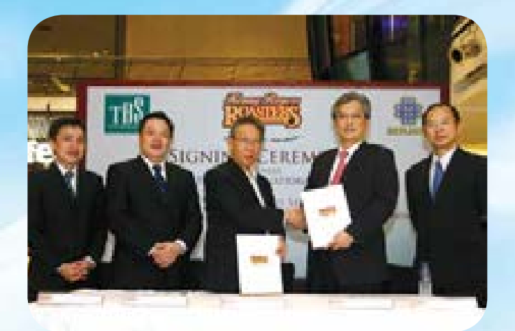
The signing ceremony between BFood and PT Boga Lestari Sentosa in December 2011.