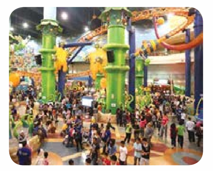
The Berjaya Times Square Theme Park was very popular with the families during BFD 2012.