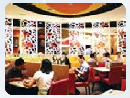
KRR outlet in MidValley Megamall, Kuala Lumpur.