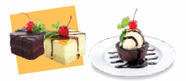
New desserts from KRR – Chocolate Fudge Cake & Classic Cheese Cake (left) and Warm Chocolate Oasis.

RAP is currently moving forward aggressively into other selected international territories namely India, Middle East and the Eastern Seaboard of the United States of America through franchising and joint ventures.