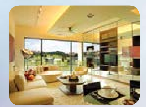
Interior - Savanna Condominium, Bukit Jalil, Kuala Lumpur.