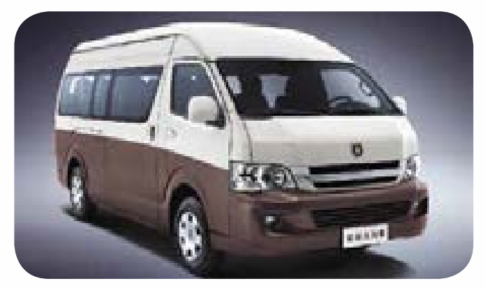
The Era Jinbei.

Priced affordably between RM63,000 and RM69,000, the Era Jinbei is currently one of the best-selling Chinese commercial vans in Malaysia.