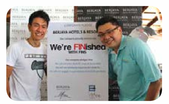
BHR's Corporate Pledge to join the "We're FINished with FINS" campaign.

In an effort to protect the world's rapidly declining shark population from rampant overfishing, BHR made a commitment not to serve shark fin soup in any of its 18 hotels and resorts worldwide. During the inaugural Tioman World Ocean Day celebration held from 29 June to 1 July 2012, BHR signed a corporate pledge to join the "We're FINished With FINS" (Save The Shark) Campaign carried out by the Singaporean chapter of Shark Savers, a non-profit marine conservation organisation dedicated to saving sharks through awareness, education and grassroots action.