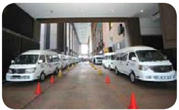
TSVT and BCorp contributed 24 vans and 2 ambulances during BFD 2012.