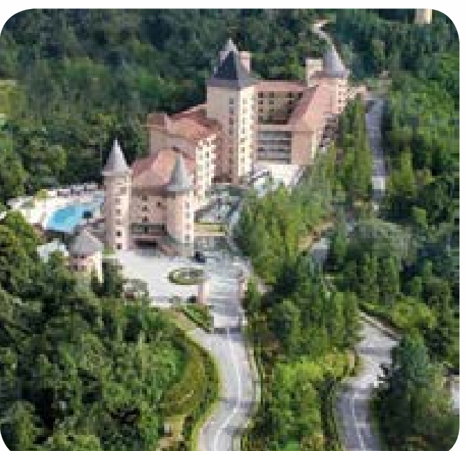
The Chateau Spa & Organic Wellness Resort, Berjaya Hills.