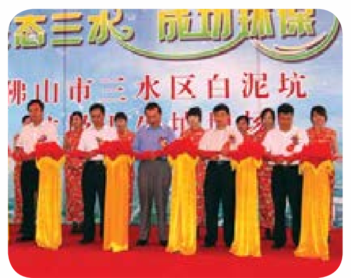
Opening ceremony of the Sanshui Bainikeng Sanitary Landfill in May 2011.

BEE also received the Outstanding & Exemplary Company of Guangdong Province Award from the Guangdong Business Council and Entrepreneur Association in July 2012.