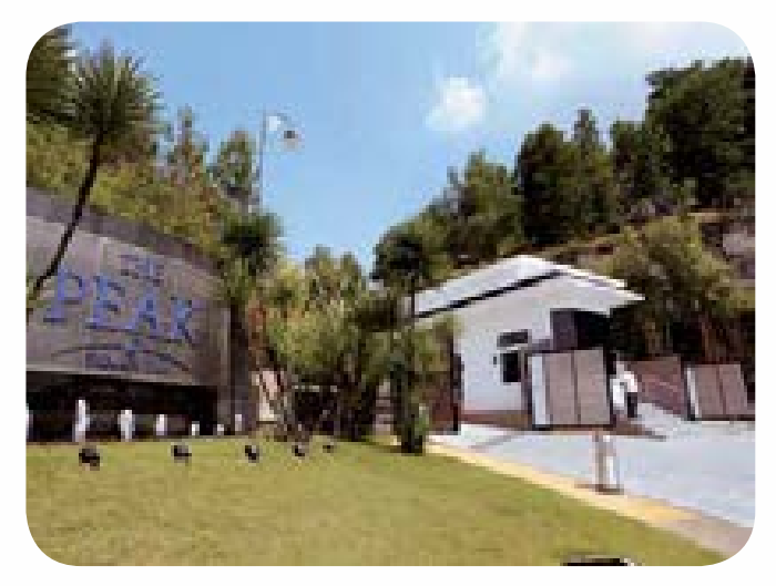
The Peak @ Taman TAR, Ampang, Selangor.

The Division's inaugural development of Grade A offices in the Central Business District of Kuala Lumpur, Corporate Suites (2) Berjaya Central Park is a 48-storey corporate suite tower with a GDV of RM576 million over a total net saleable area of 464,413 sf. Offering 207 office sites, the Grade A office tower is designed with eco-friendly features that meet the BCA Green Mark Gold certification by the Building and Construction Authority (BCA) of Singapore, an international yardstick to rate the environmental friendliness of a building.