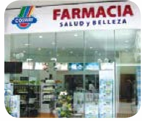
A Cosway store in Mexico.

Subsequent to the financial year end, the KLCI remained rangebound due to the global economic uncertainties contributing to lacklustre trading volume in the stock market. However, locally, with the Economic Transformation Programme ("ETP") initiatives, the economy is likely to be more resilient and the real Gross Domestic Product ("GDP") is expected to show improvement. With the Government's efforts to improve the economy, the stock market performance is expected to improve and the KLCI is expected to trend upwards. IPC remains optimistic that its operations will return to profitability in the current financial year ending 30 April 2013.