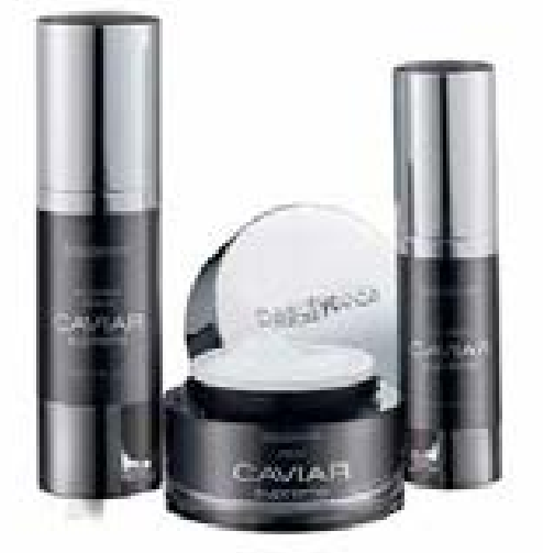
Cosway's Cavier Supreme range of products.

Pre-tax profit from continuing operations increased 4.28% compared to the previous financial year mainly due to the recognition of gain from the disposal of 40% equity interest in BSompo. The gaming business registered an increase in pre-tax profit mainly due to lower prize payout while the hotels and resorts reported an improvement in pre-tax profit as a result of higher occupancy rates and room rates. However, the increase in pre-tax profit was moderated by lower contribution from Cosway as the expansion of its retail distribution network into new markets involved high initial expense and overheads, as well as lower contribution from the property investment and development business due to lower progress billings.