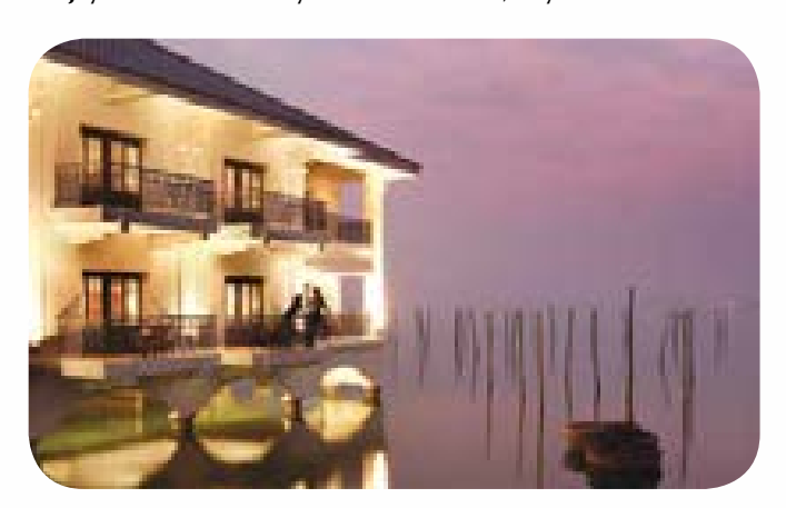
InterContinental Hanoi Westlake, Vietnam.