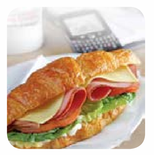
Krispy Croissant with Bologna – a KKD Baked Creations sandwich.