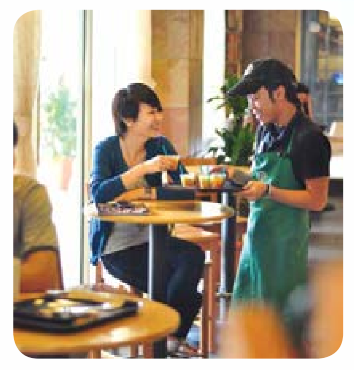
Starbucks is a "Third Place" between work and home for its customers.

On 19 July 2012, BFood completed the acquisition of 11,500,000 ordinary shares of RM1.00 each, representing 50% equity interest in Starbucks Coffee from BGroup for a cash consideration of RM71.7 million.