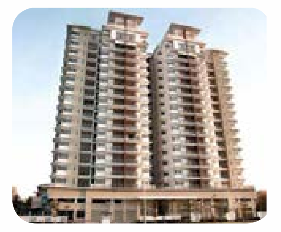
Amber Court, Bien Hoa City Square, Vietnam.

Another residential development currently in progress within the garden township of Ha Noi Garden City is Avenue Park , comprising 2 towers of 12-storey apartments which will house 189 units of exclusive apartments complete with apartment amenities and facilities in a gated and guarded development. When completed, Avenue Park will add to the many notable residential and commercial developments in Ha Noi Garden City .