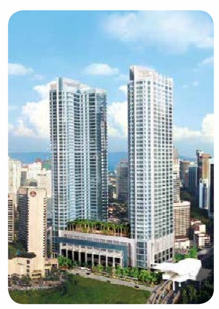
Menara Bangkok Bank @ Berjaya Central Park, Kuala Lumpur.

In Vietnam, the Division has successfully completed its maiden project in Bien Hoa City Square , Ho Chi Minh City. Amber Court , comprising 116 units of condominiums within a 17-storey block, was handed over to purchasers in the year under review. The total GDV of this project was United States Dollar ("USD") 11 million. The Division is ready to launch the next phase of residential development in Bien Hoa City Square, Topaz Twins , comprising 2 blocks of 20-storey apartments with 448 units, once the market sentiment improves.