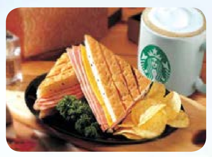
Starbucks offers a variety of handcrafted beverages and menu items.

consideration of RM71.7 million ("Starbucks Disposal") and proposed renounceable rights issue of up to 118.94 million new ordinary shares of RM0.50 each in BFood ("BFood Rights Shares") together with up to 118.94 million free detachable warrants ("BFood Warrants") at an issue price of RM0.65 per BFood Rights Share on the basis of 4 BFood Rights Shares with 4 BFood Warrants for every 5 existing BFood shares held ("Rights Issue"). The Starbucks Disposal was completed on 19 July 2012 whilst the Rights Issue was completed on 13 August 2012. Consequently, Starbucks Coffee is now 50%-owned by BFood.