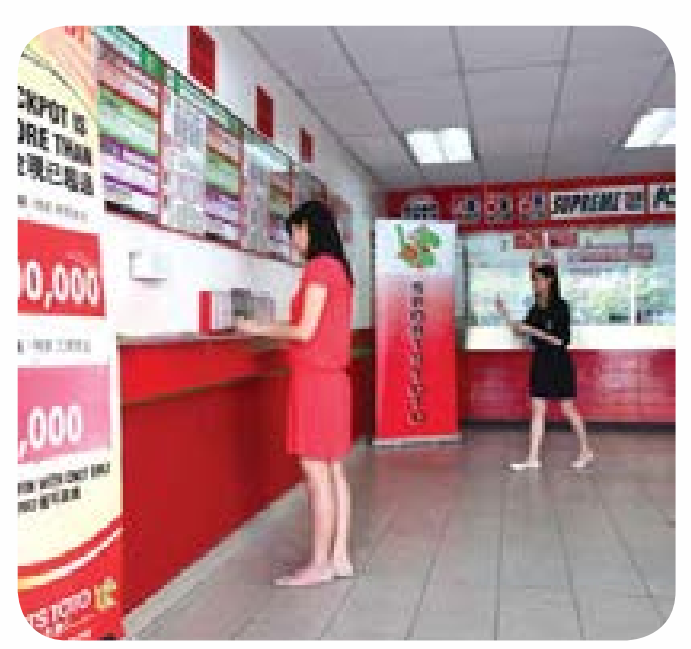
A Sports Toto outlet.

On 2 August 2012, Sports Toto successfully relocated its back-up data centre from Menara Standard Chartered, Kuala Lumpur to Cyberjaya 3 in Cyberjaya.