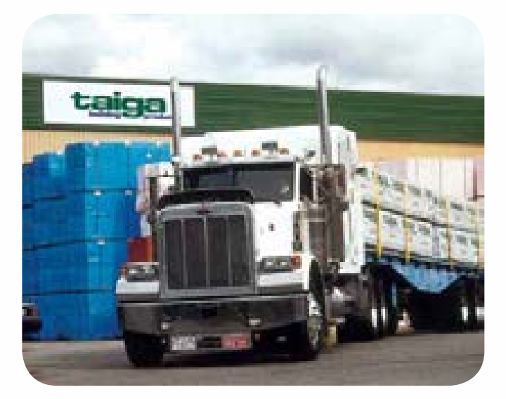
Taiga Building Products Ltd.