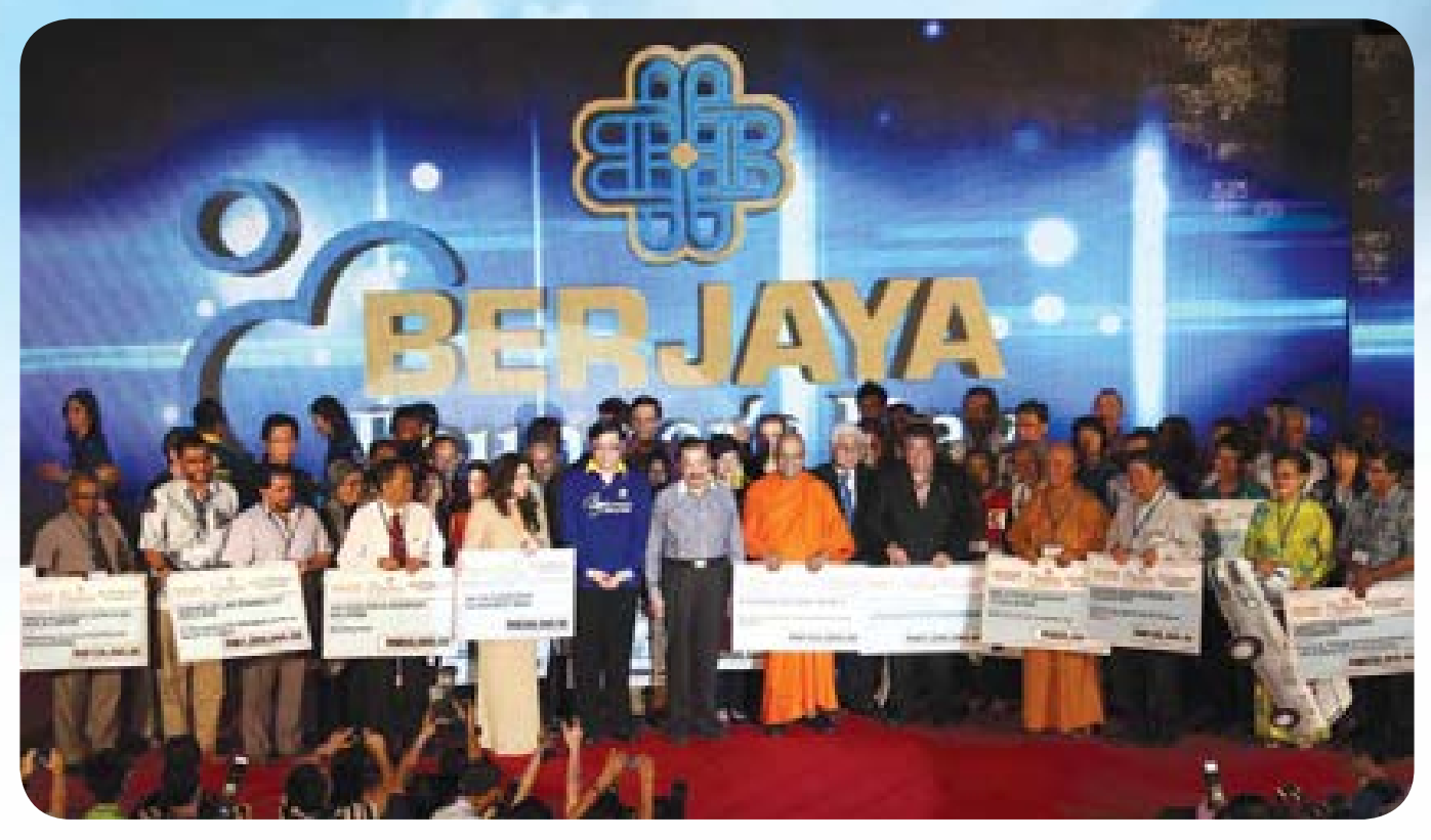
TSVT and BCorp contributed a total of RM11.6 million to 61 non-profit and charitable organizations during BFD 2012.