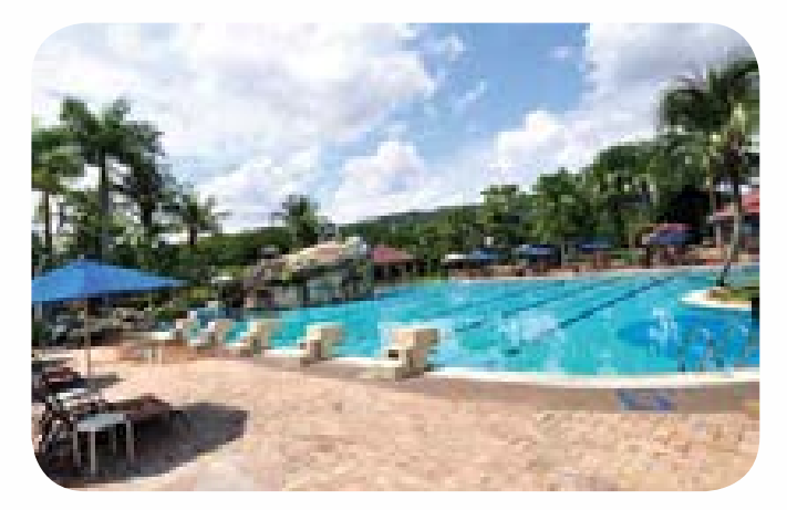
Poolside – Bukit Kiara Equestrian and Country Resort, Kuala Lumpur.

The BVC Online Reservation system which was launched in June 2010 has received good response from members and has processed more than 126,000 transactions in a 2-year period. During the year under review, the system was enhanced based on members' feedback to make it more user-friendly and to reduce booking errors.