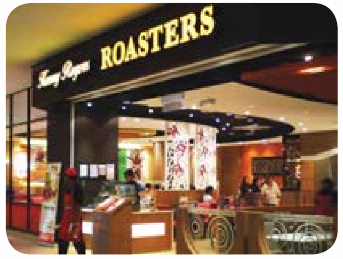
KRR outlet in MidValley Megamall, Kuala Lumpur.

In March 2011, KRR won the BrandLaureate Best Brands Awards 2010-2011 under the Food & Beverage category for its famous signature rotisserie-roasted chicken.