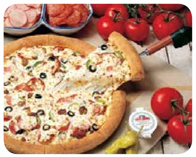
Papa John's uses only superior quality ingredients for its hand-made pizzas.