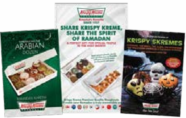
KKD's variety of seasonal promotional doughnuts.

BKKD's future plans include new store openings, aggressive marketing programmes and campaigns, and the introduction of attractive seasonal promotions on products and beverages. A variety of sandwiches are also available under the KKD Baked Creations programme.