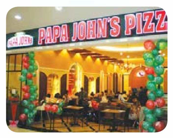
Papa John's Pizza outlet in Mahkota Cheras, Kuala Lumpur.

For the financial year ended 30 April 2012, BPJP registered a higher revenue of RM12.4 million compared to RM9.6 million in the previous year due to more store openings. BPJP successfully opened 3 new outlets around the Klang Valley in the financial year under review. The new outlets are located at Plaza Shah Alam, KL Festival City and AEON Anggun, Rawang. This brings the total number of Papa John's Pizza outlets to 11 in the Klang Valley and 1 in Melaka.