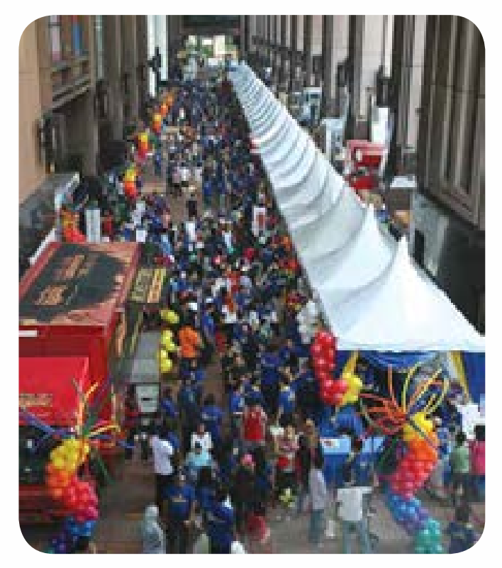
More than 20,000 Berjaya staff and their families enjoyed the carnival at Berjaya Times Square.

The second Berjaya Founder's Day ("BFD") was celebrated with much gaiety in a carnival-like atmosphere on 25 February 2012 at Berjaya Times Square. The family day themed event which involved concerted and coordinated effort across the Berjaya Corporation group of companies, was also a day dedicated to serving and engaging the community for a common good cause in line with TSVT's belief in corporate philanthropy.