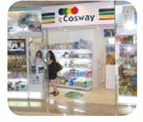
A Cosway store in Hong Kong.