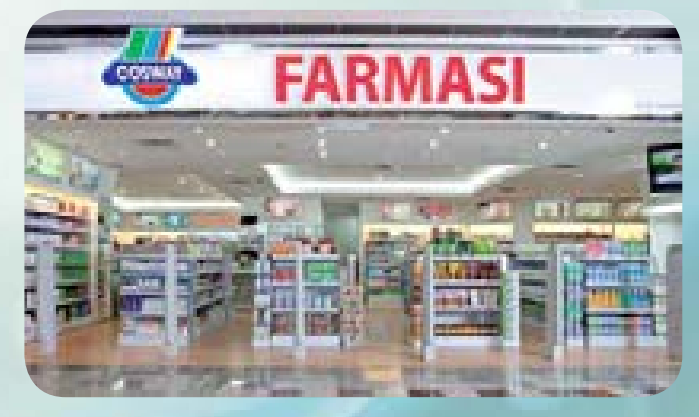
Cosway store at Berjaya Times Square, Kuala Lumpur.