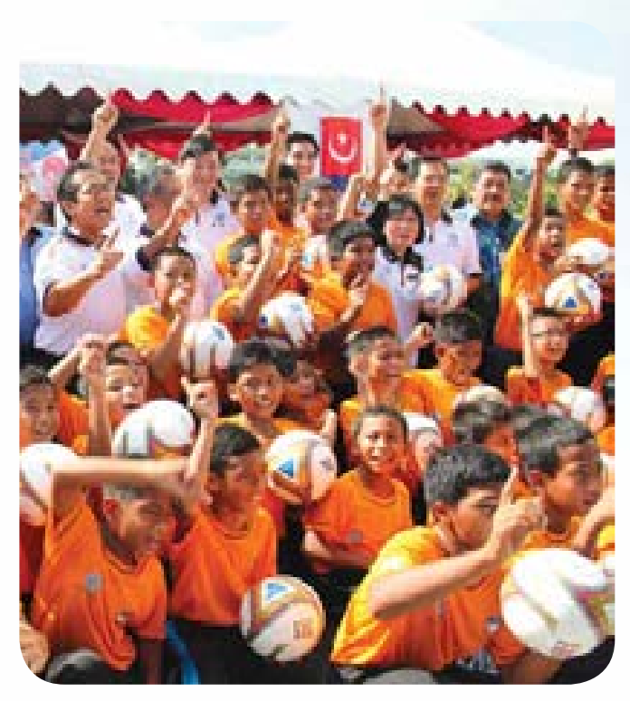
BCorp presented 15,000 footballs to schools nationwide.