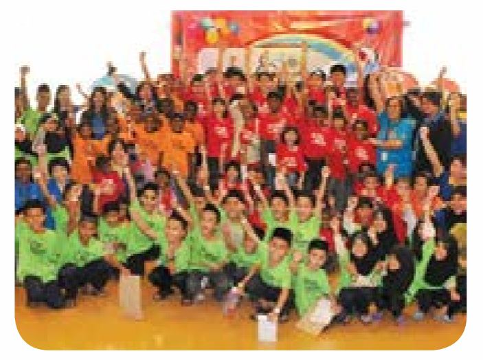
Annual children's outing to Berjaya Times Square Theme Park.

For the 12th consecutive year, BCorp continued to support The Edge-Bursa Malaysia Kuala Lumpur Rat Race, an annual corporate charity run jointly organized by The Edge and Bursa Malaysia. The charity run provides a platform for the Group's employees to fulfill their social responsibility role while participating in a sporting event.