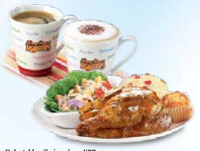
Delectable offerings from KRR.