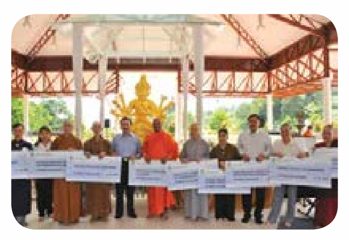
TSVT with beneficiaries at the 4-Faced Buddha shrine in Berjaya Hills, Pahang.