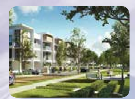
Garden Villas, Hanoi, Vietnam.