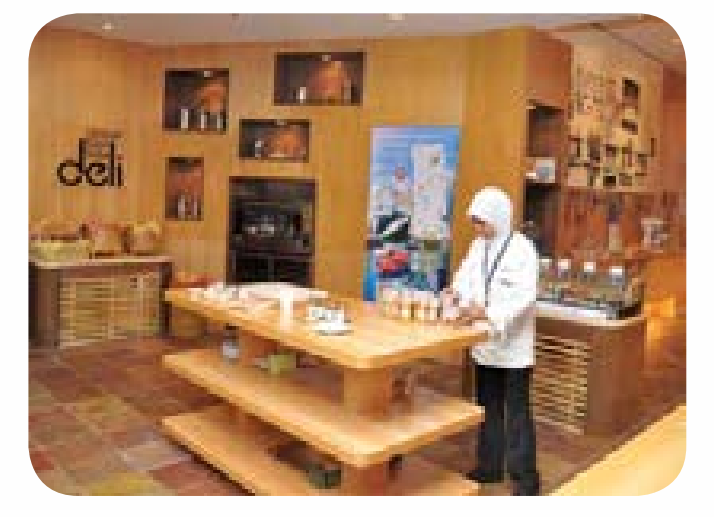
Upper East Side Deli – Berjaya UCH.