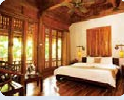
Deluxe Room – Long Beach Resort, Phu Quoc Island, Vietnam.