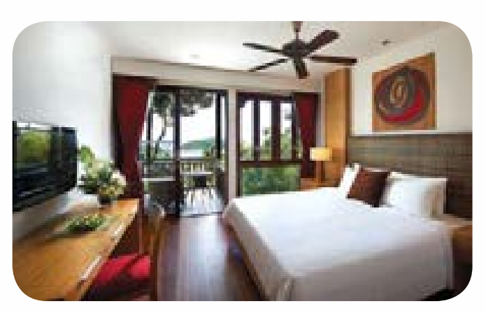
Rainforest Chalet - Berjaya Langkawi Resort, Kedah.