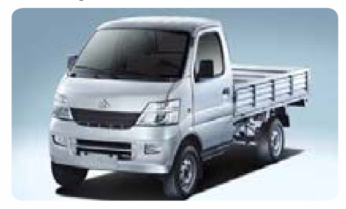
The Era Star Pick Up.

In line with the introduction of the Era Star Pick Up, CBA is actively improving its after sales service experience, with a new Corporate Brand Identity exercise to be carried out at its service centres throughout 2012 and 2013.