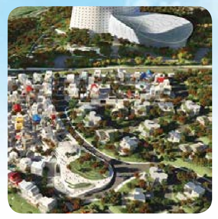
Aerial view of Gotjawal Village, Berjaya Jeju Airest City, Jeju Island, Korea.

The Division's foray into South Korea is also progressing with the impending launch of the first phase of development at Berjaya Jeju Airest City . Berjaya Jeju Airest City, is a sprawling 183.7 acres of self-sustaining creative business resort type development with various components such as residential units, casinos, hotels, shopping malls and other leisure and health facilities. It is located at Yerae-Dong, Seogwipo City, Jeju Island.