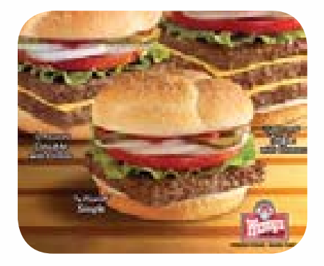
Wendy's signature burgers.

Berjaya Krispy Kreme Doughnuts Sdn. Bhd. ("BKKD")