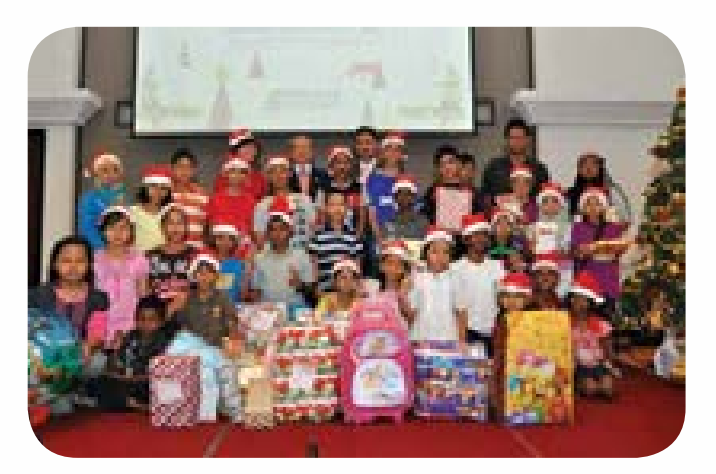
Berjaya UCH brought Christmas cheer to the children from Yellow House.

As part of its commitment to community service, Starbucks Malaysia celebrated its second annual Global Month of Service throughout the month of April 2012 and executed 27 CSR projects nationwide with an accumulated 8,898 community service hours.